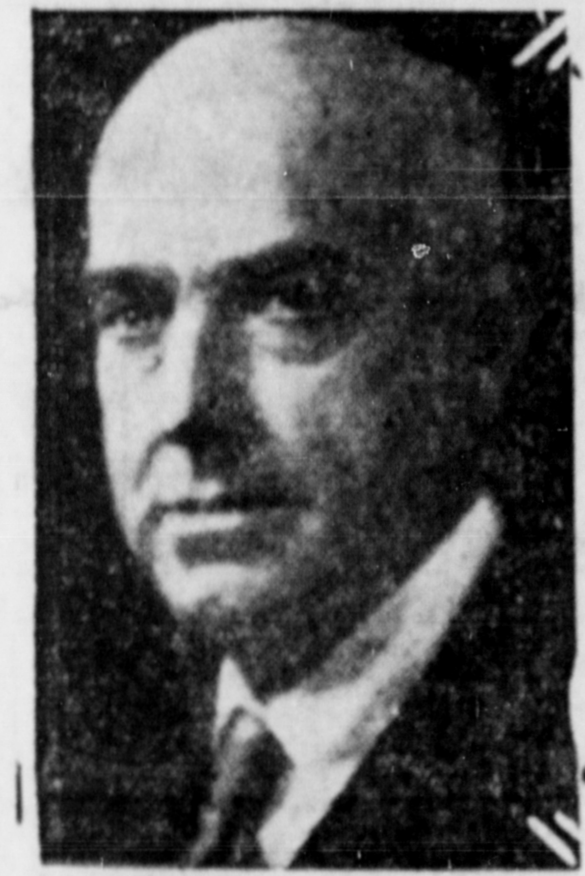
Senator A. D. McRae who urges Canada to withdraw from League of Nations.

Senator Raoul Dandurand, also speaking in the Upper Chamber, appealed to the United States to join the League of Nations.