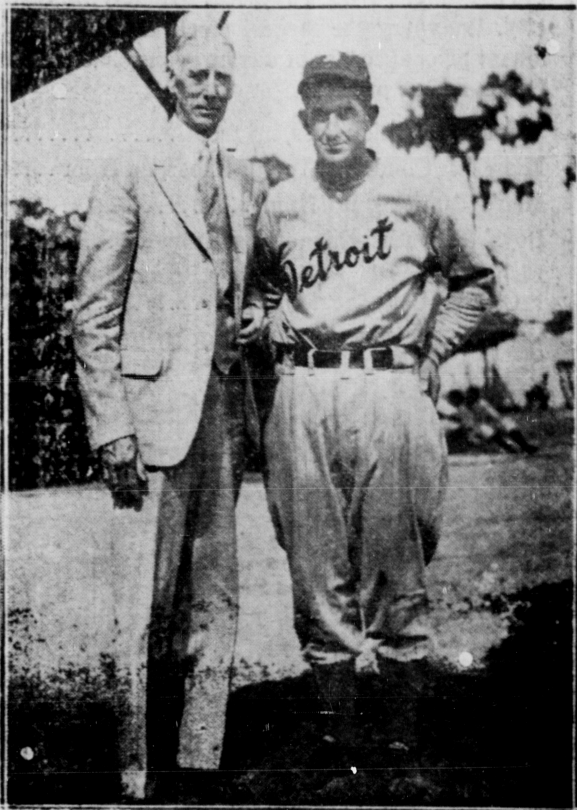
Connie Mack (left) got his first look at his old catcher, Mickey Cochrane, in a Detroit Tiger uniform recently when Mack's Athletics trimmed Mickey's Tigers to the tune of 7 to 2 in the first of a series of exhibition games at Lakeland, Fla., where the two teams are training. Those who know expect a hot managerial rivalry between the two men.