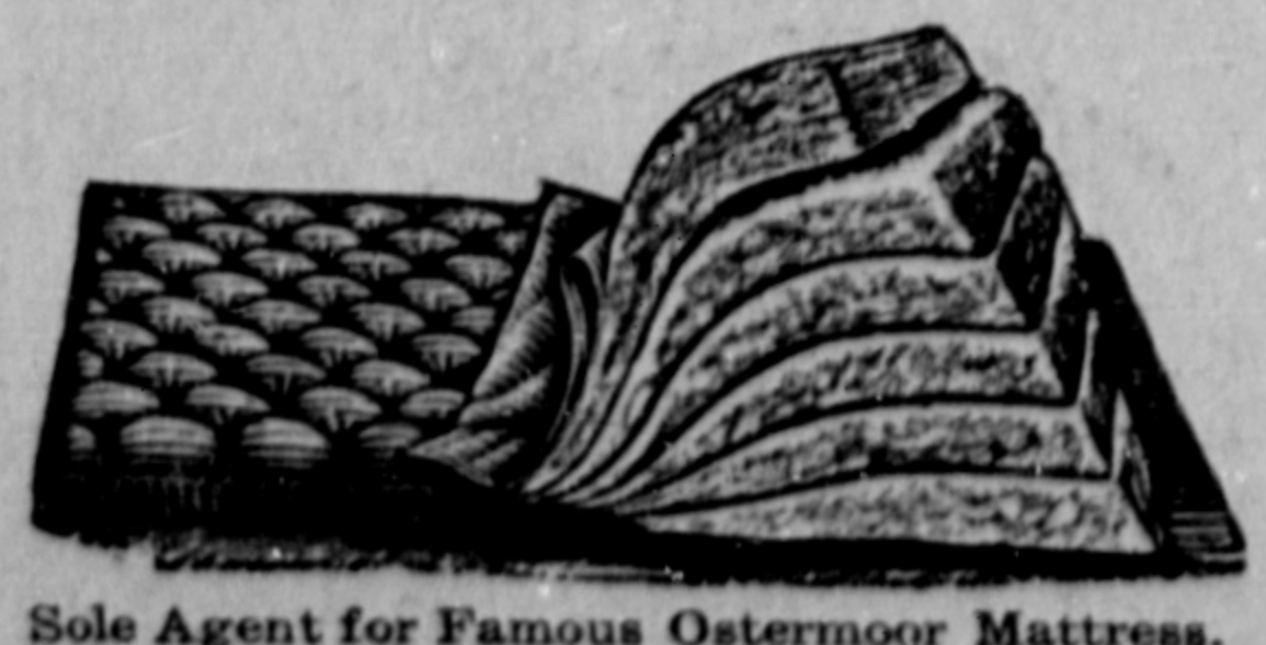
Sole Agent for Famous Ostermoor Mattress.

For the next two weeks we will occupy the entire Hart Block and during that time we shall offer some Great Values in Furniture and Home Furnishings