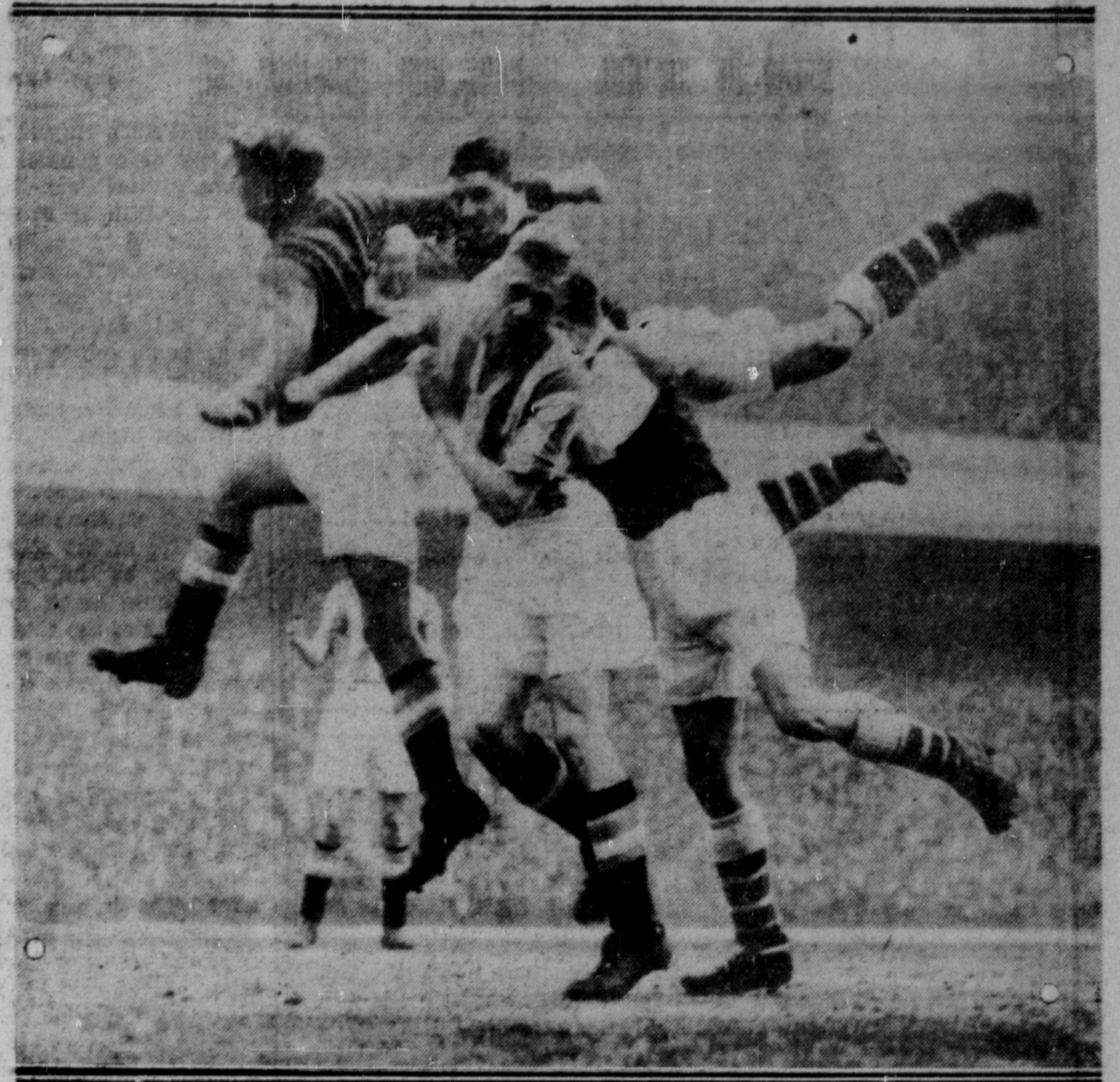
My! My! What a mess! It really isn't an octopus as you might suspect as first glance, but actually a tangle of arms, legs and bodies emerging from a simultaneous flying leap. The picture was snapped during a recent match between Arsenal and Huddersfield, with an Arsenal forward in the act of bouncing the ball from his head to his opponents' goal.