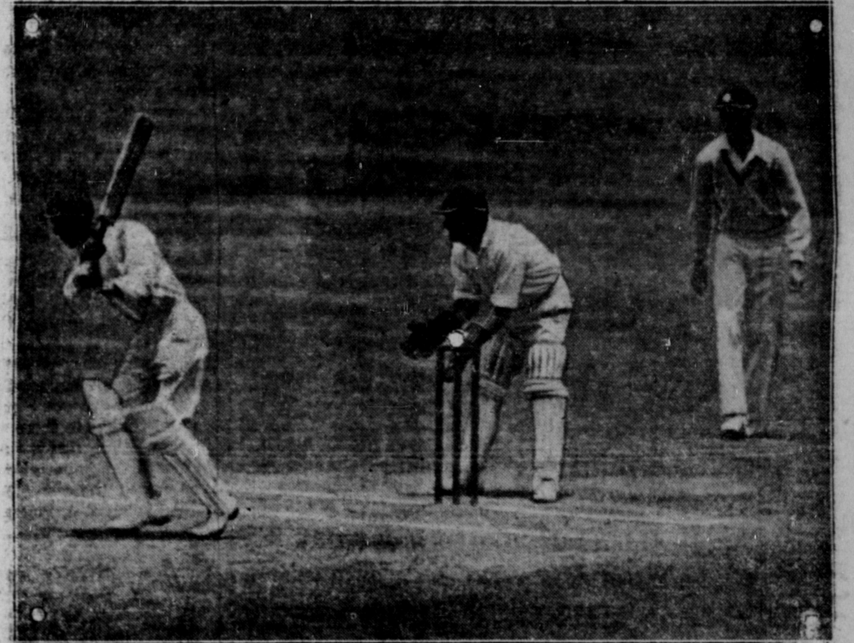
When New South Wales met Queensland at Sydney, Australia, recently in a cricket match, Messrs. Bradman and Kippax made cricket history when they completed 363 runs for the third wicket. Kippax is shown above, snapped while making a long drive. He will accompany the Australian team on its tour of England.