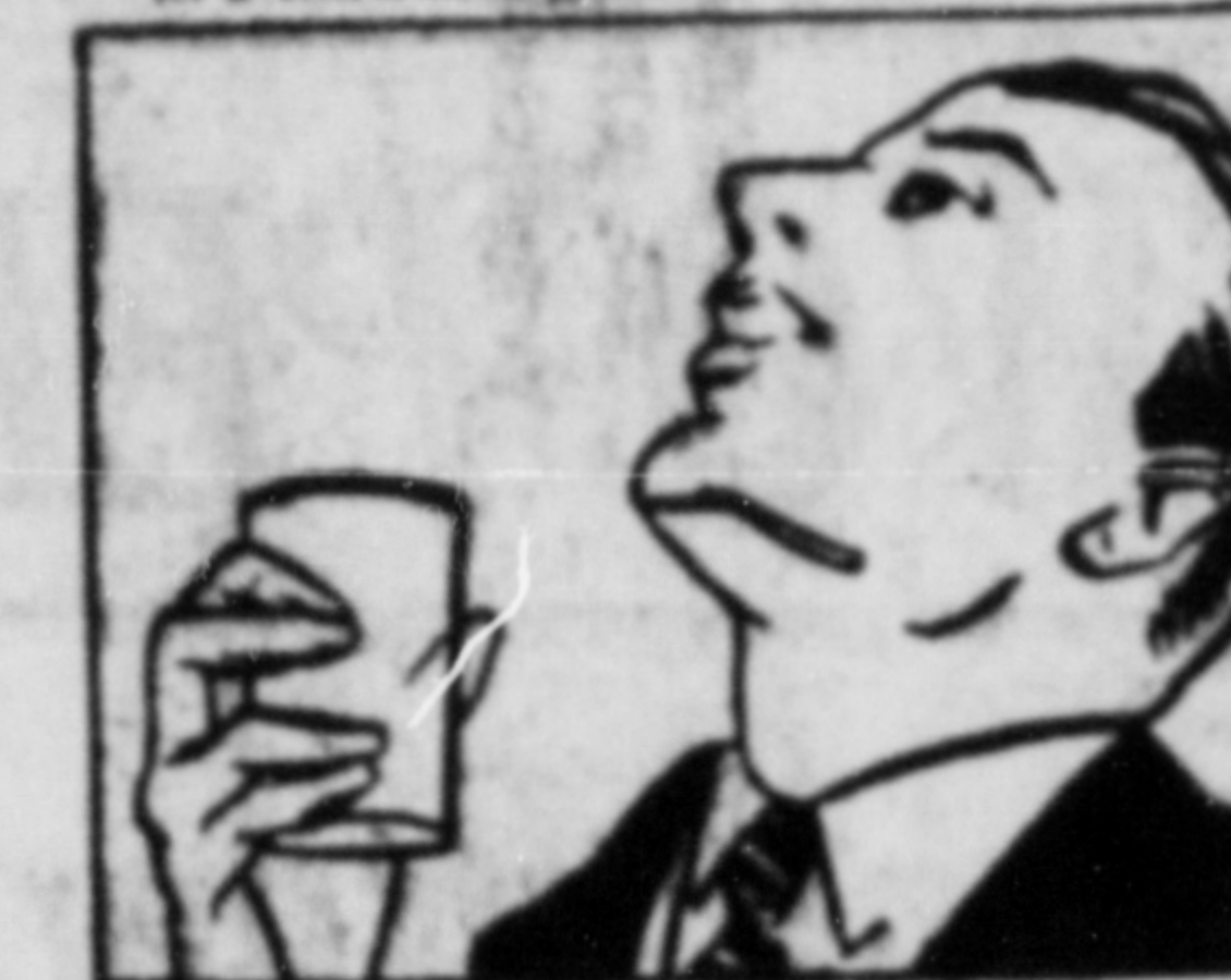
2. Gargle thoroughly—throw head way back, allowing a little to trickle down throat. Repeat—do not force mouth.