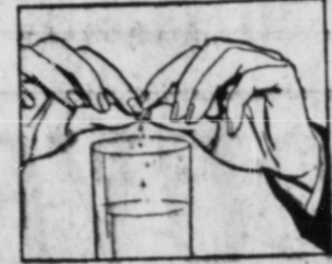
1. Crush and stir a Aspirin tablet in a third of a glass of water.