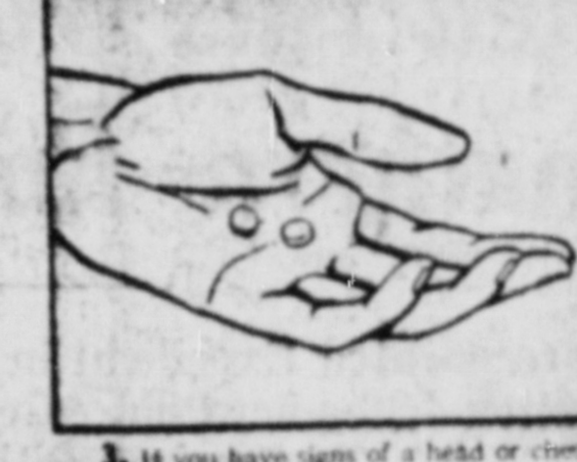
3. If you have signs of a head or cold take 2 Aspirin tablets—drink a full glass of water. Repeat in 2 hours.

Rawness, Irritation Go at Once Note Directions for New Instant Treatment