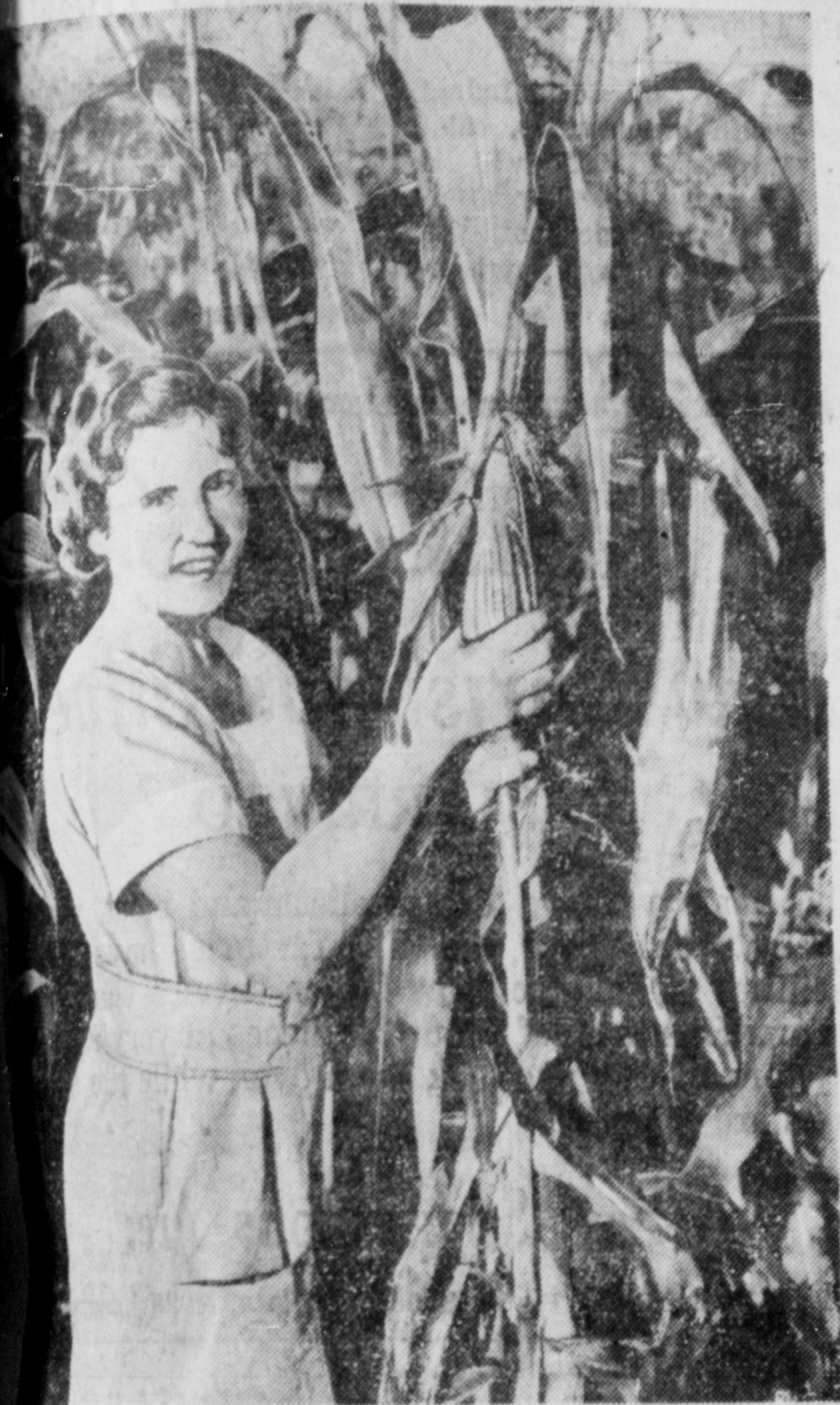
Two Chilliwack products, both keeping up the quality of Royal City Foods. The great height of this corn is an indication of the perfect growth and full flavor of its crop, which is produced exclusively for the Royal City Plant at Chilliwack. The young lady but one of many employed in this plant, who invite you to try this wholesome Royal City Food.