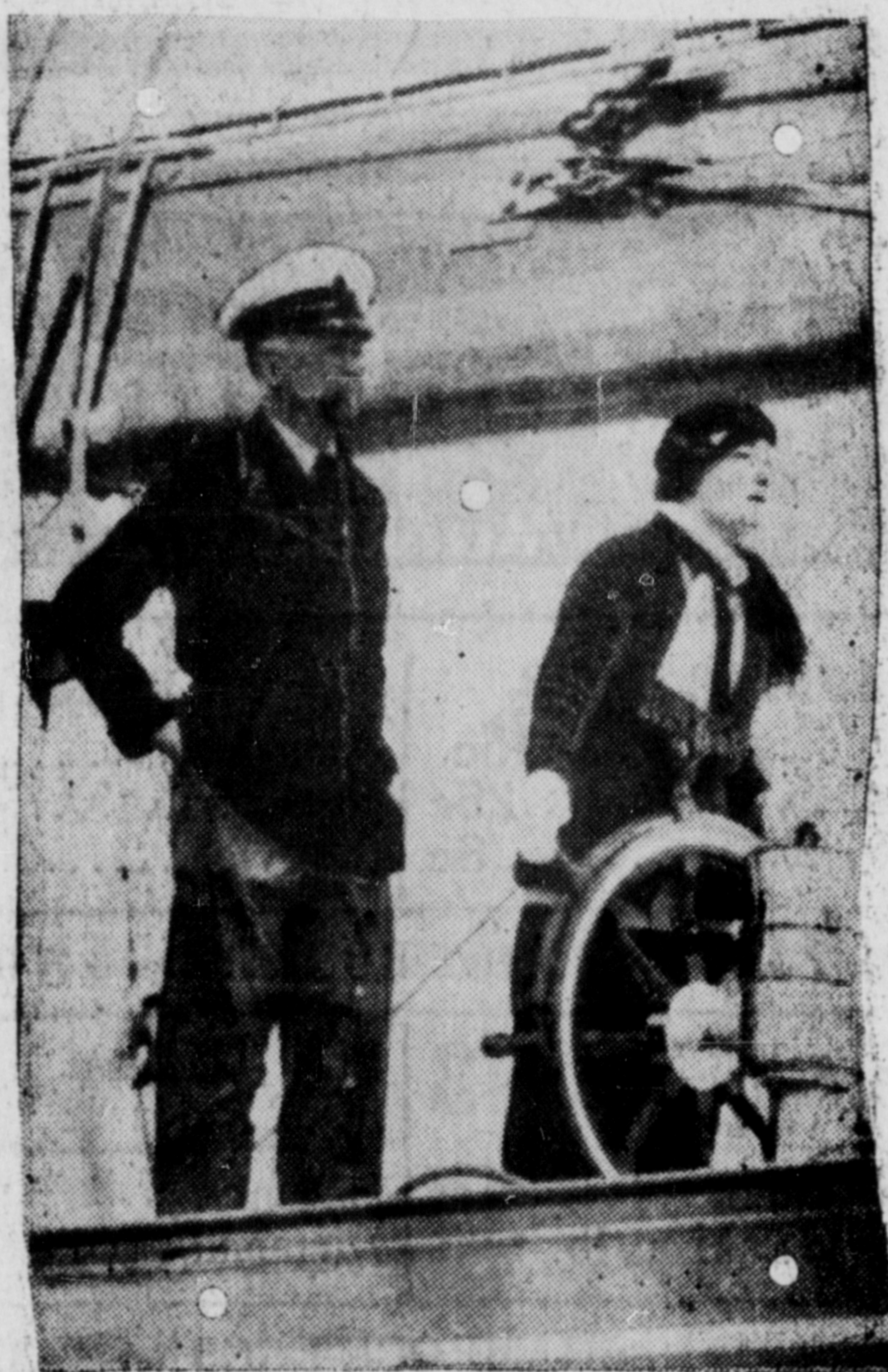
CAPT. AND MRS. T. O. M. SOPWITH

PORTSMOUTH, England, August 30 (Canadian Press)—T. O. M. Sopwith has decided to build a new challenger for the America's Cup to be known as the Endeavour II. It is expected it will be ready to launch in May of next year. (picture shows Capt. and Mrs. Sopwith at the helm of Endeavour I, which nearly lifted cup last year.)