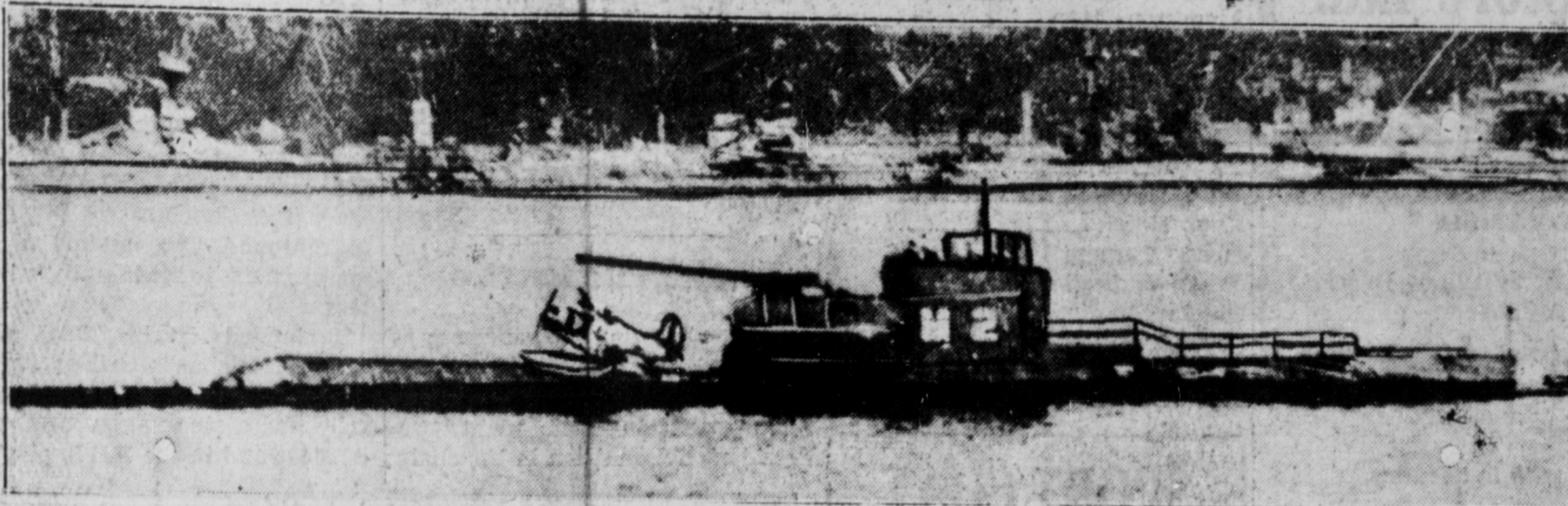
Britain's sleek submarines, working as death-dealing auxiliaries of the increasing Mediterranean fleet, are playing an important part in the veiled naval manoeuvres which are being eyed askance by Italy.