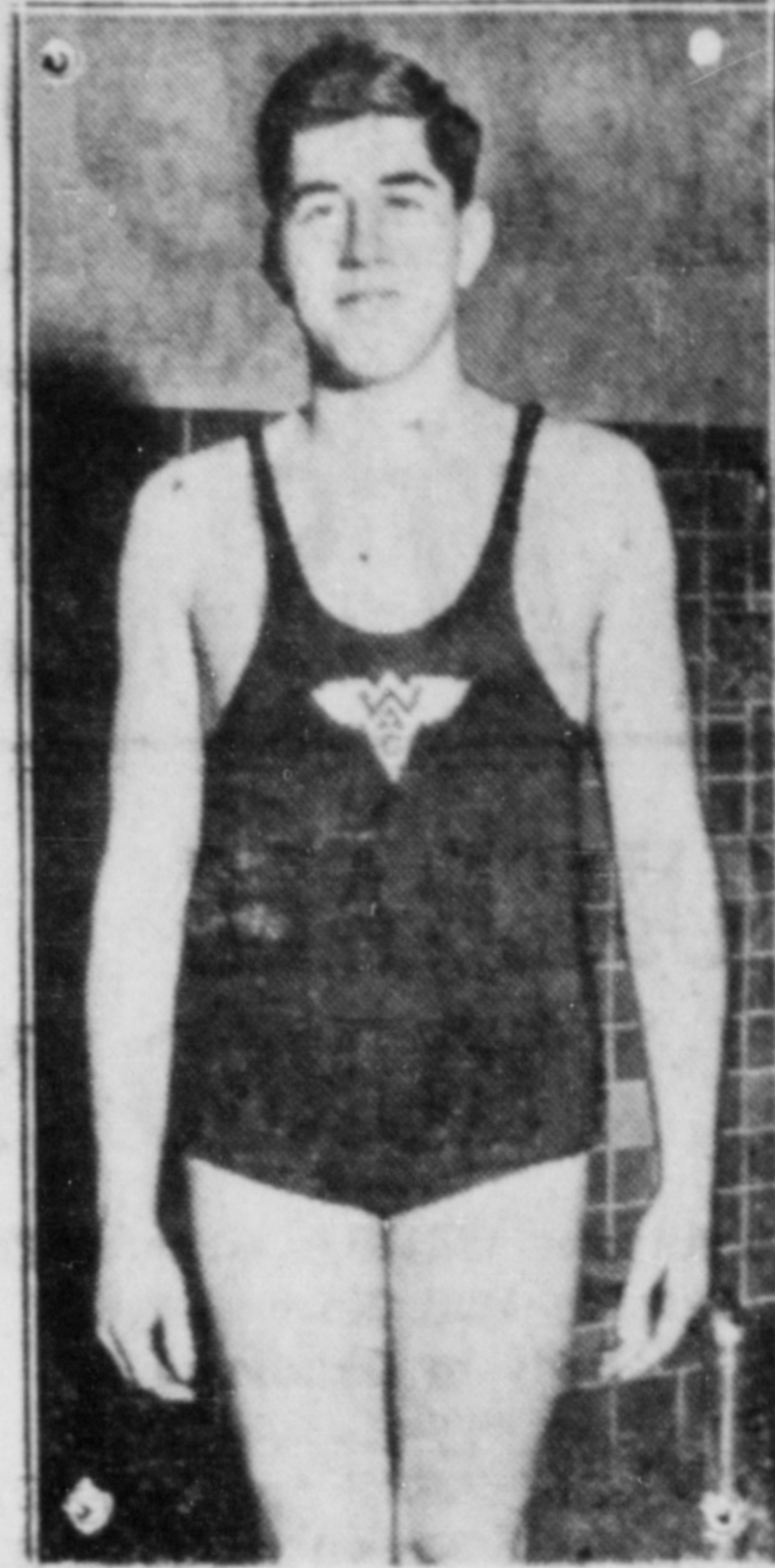
Seattle swimming star who set new record at Tokyo for 400-metre free style swim.