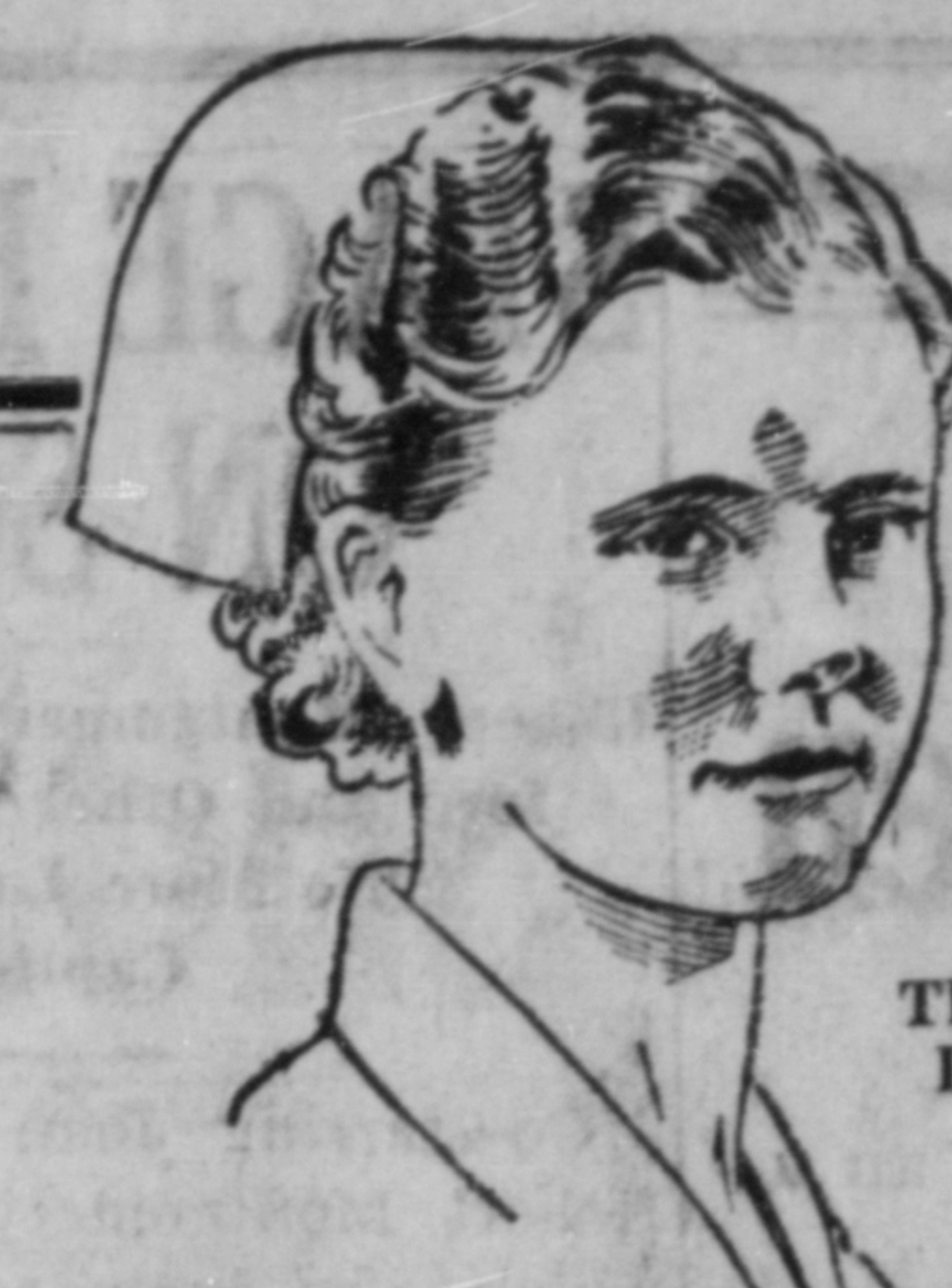
The Royal City Dietitian suggests