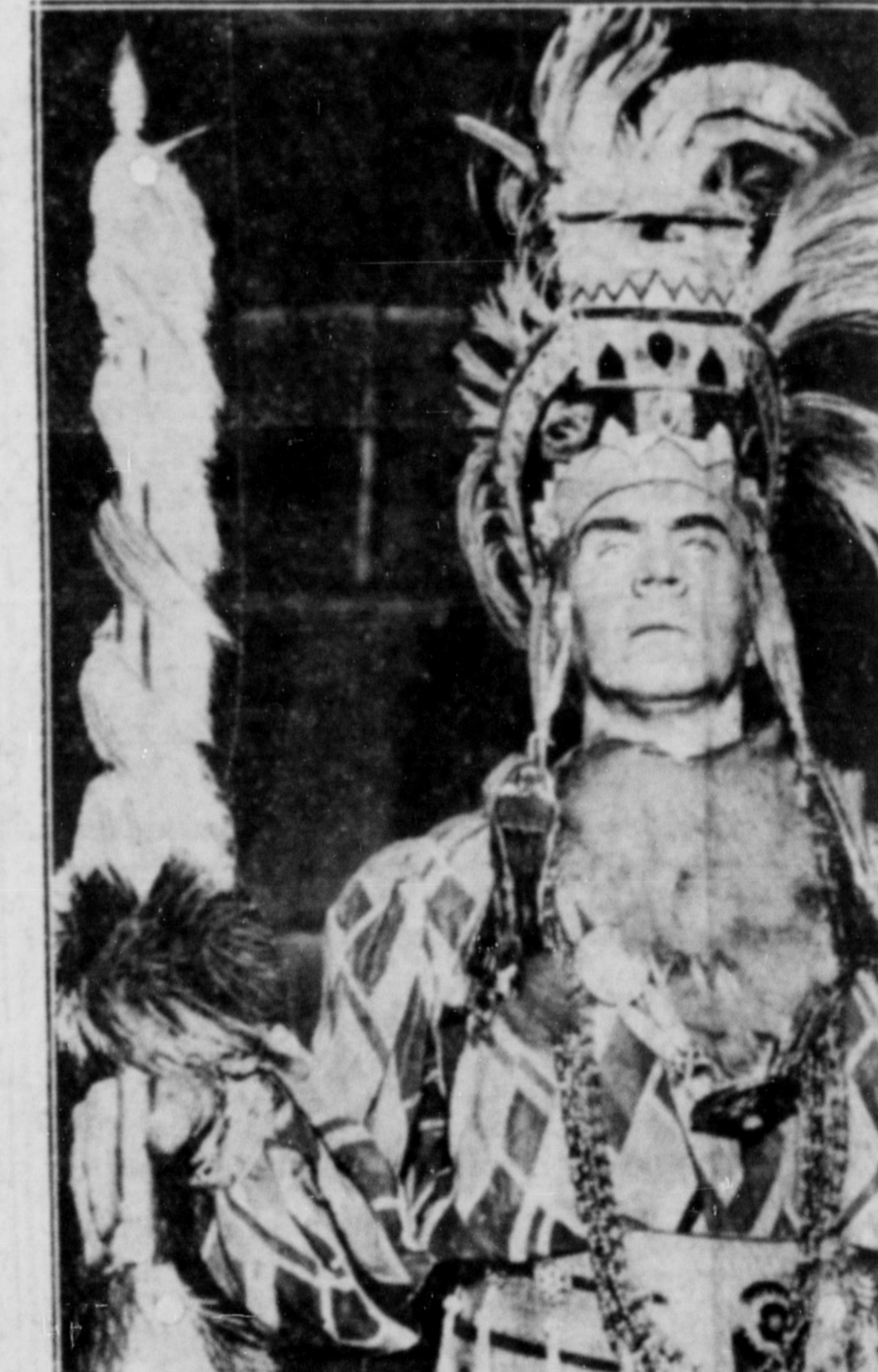
The pageant in the grandstand at the Canadian National Exhibition at Toronto last year had a Mexican setting. This dangerous-looking fellow is the montezuma. To the Mexicans he is ruler supreme. He headed the play.