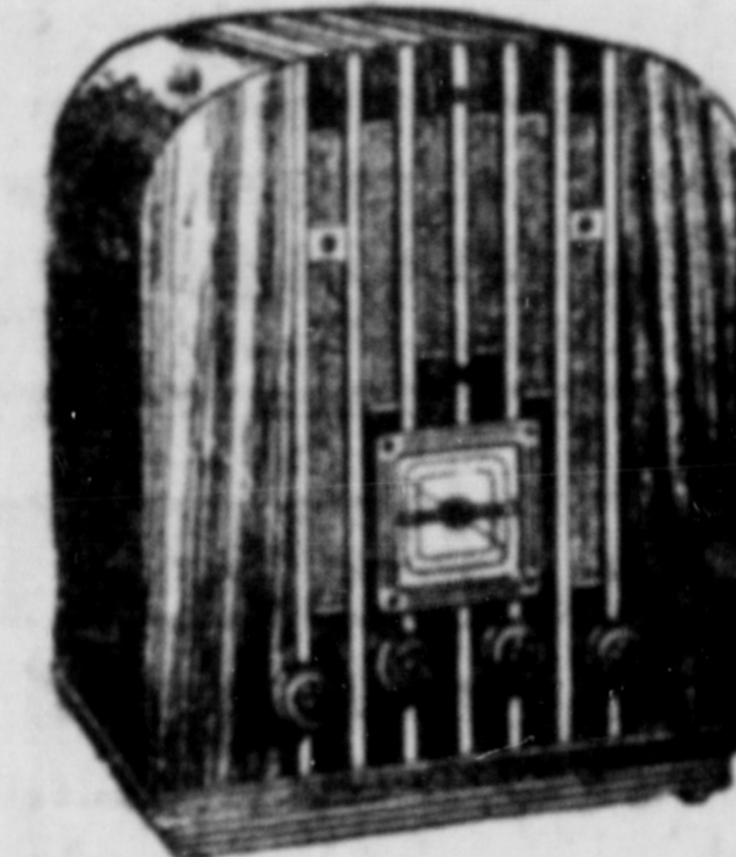
Model M-51 $65.50