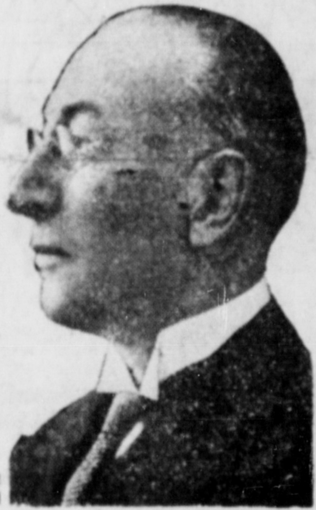
HON. E. N. RHODES

OTTAWA, March 20: (CP)—Hon. Edgar N. Rhodes, minister of finance, will present his budget to Parliament on Friday, it was announced yesterday.