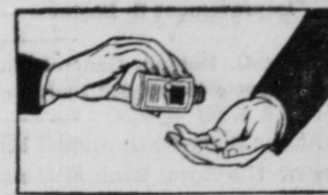
1. Take 2 Aspirin Tablets.