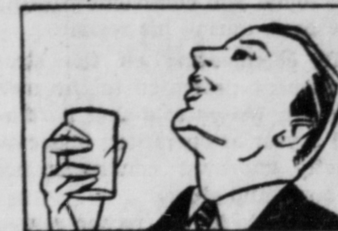
3. If throat is sore, crush and stir 3 Aspirin Tablets in a third of a glass of water and gargle. This eases the soreness in your throat almost instantly.

Follow Directions to Ease Pain and Discomfort Almost Instantly