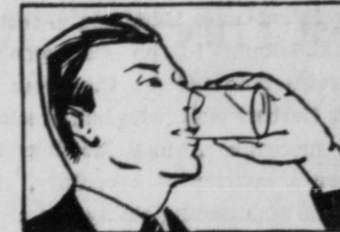
2. Drink full glass of water. Repeat treatment in 2 hours.