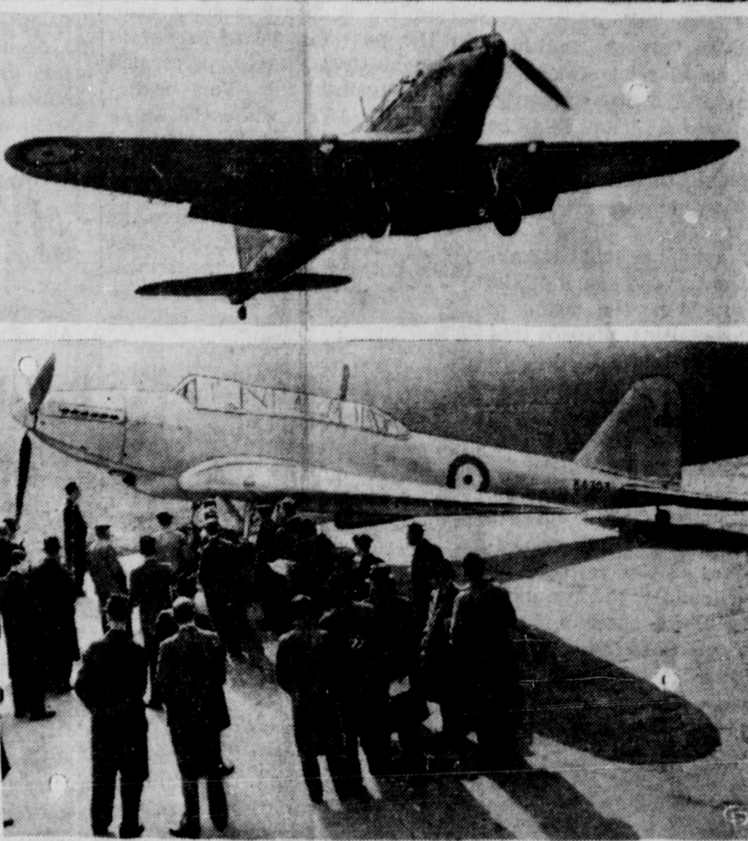
The aeroplane shown in the layout is the latest thing in instruments of destruction, and illustrates graphically the armament-maker's art. The aeroplane, which is the new R.A.F. "Fairey" bombing aeroplane, is so fast that it makes combat aeroplanes useless. With a speed of over 300 miles per hour, non-breakable glass encasements for the pilot and gunner, special fighting equipment in addition to bombs, the new aircraft marks a long forward step in the development of attacking aeroplanes. So effective is the machine, however, that British aviation experts