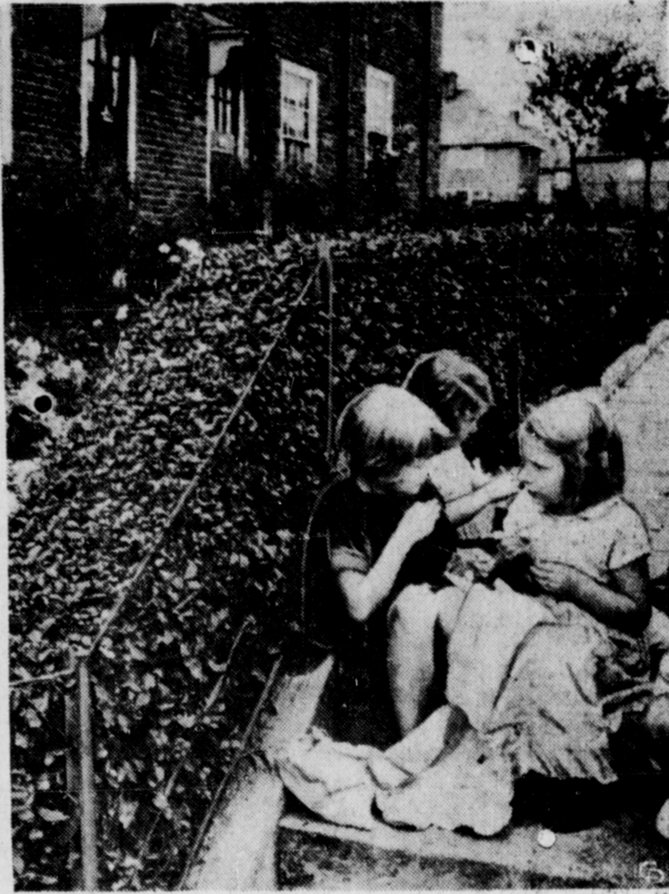
While some work has been done toward the clearing of the slum of Britain, the claim is made by the London County Council that it is mostly talk and not much action. The council, composed largely of Labor representatives, is launching a new plan for London's metropolitan area. Above are actual scenes of slum clearance in London, showing a new street where children may play in safety and enjoy plenty of sunlight and fresh air. Left, a scene in a section of London's slum area showing intolerable conditions in which one-sixth of the population of Britain are forced to live.