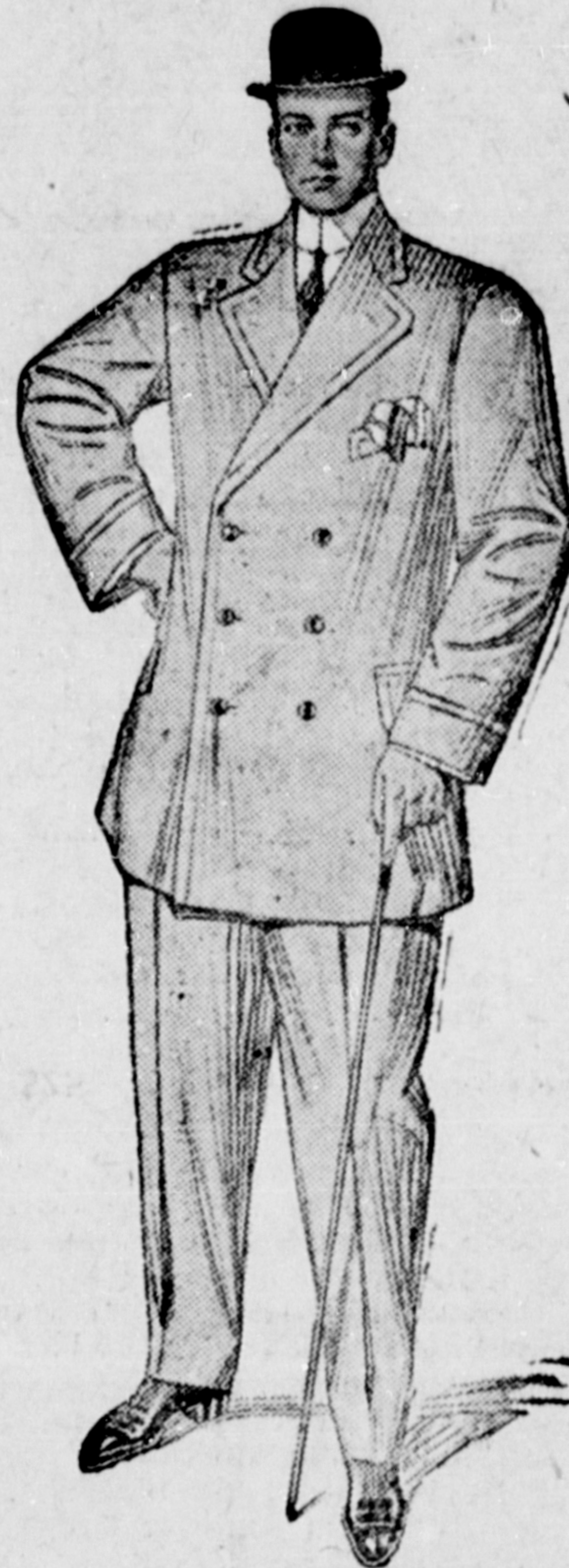
$25.00 Tweed or Worsted Suit