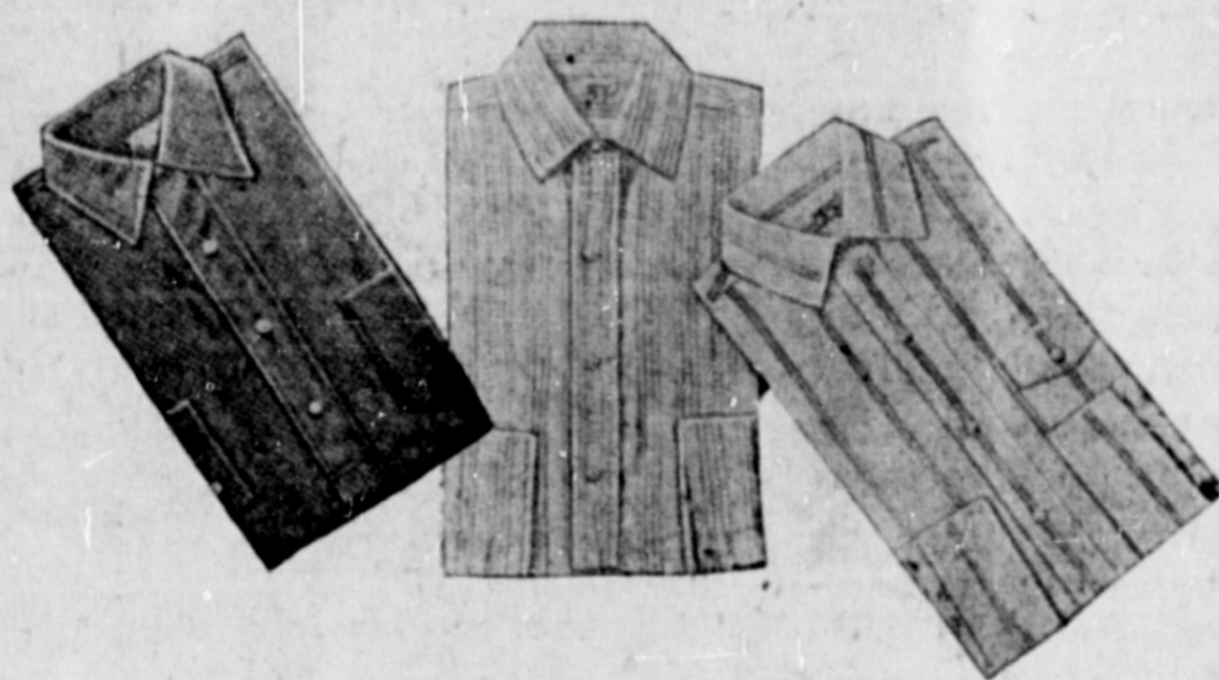
Men's Negligee or heavy working shirts, regular $1.50, now $1.00

In a few days we will be moving to our new store on Third Ave., but before doing so we must reduce our very large stock of high-class Clothing, Furnishings, etc., by one half. To do this and do it quickly, it is to be sacrificed at ridiculously low prices. COME AND HELP US MOVE BY BUYING YOUR FALL CLOTHING NOW.