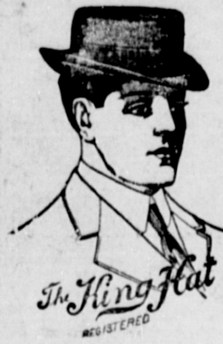
Men's Fedora or Crush Hats, reg. $3 now $1.50