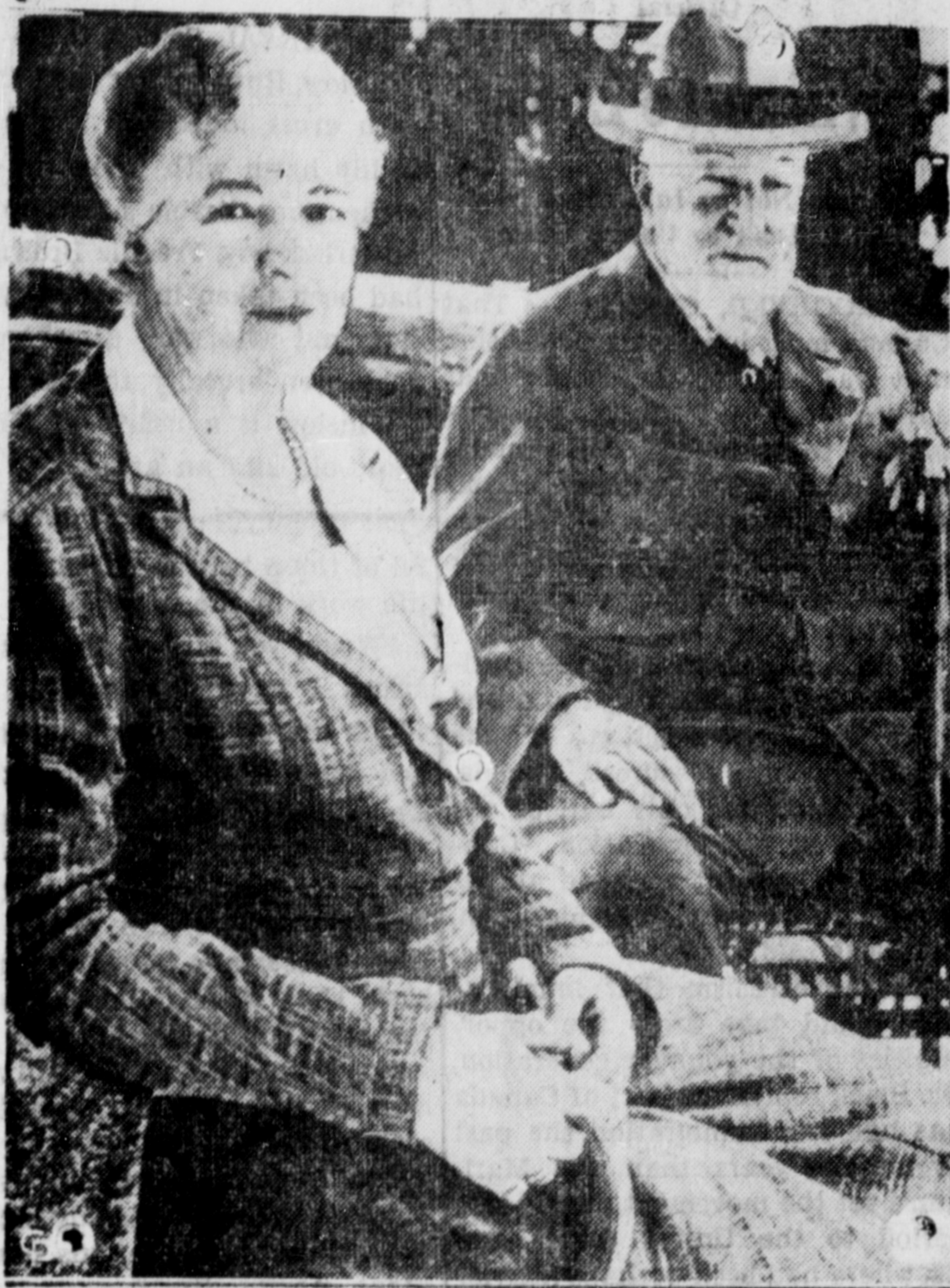
Two former crowned heads of Europe occupy chairs on the terrace of their hotel, overlooking Lake Lucerne at Burgenschloch, Switzerland, and, perhaps, dream of the days when they sat on thrones of gilt and purple plush. They are ex-Queen Amelie, of Portugal and ex-King Ferdinand of Bulgaria.