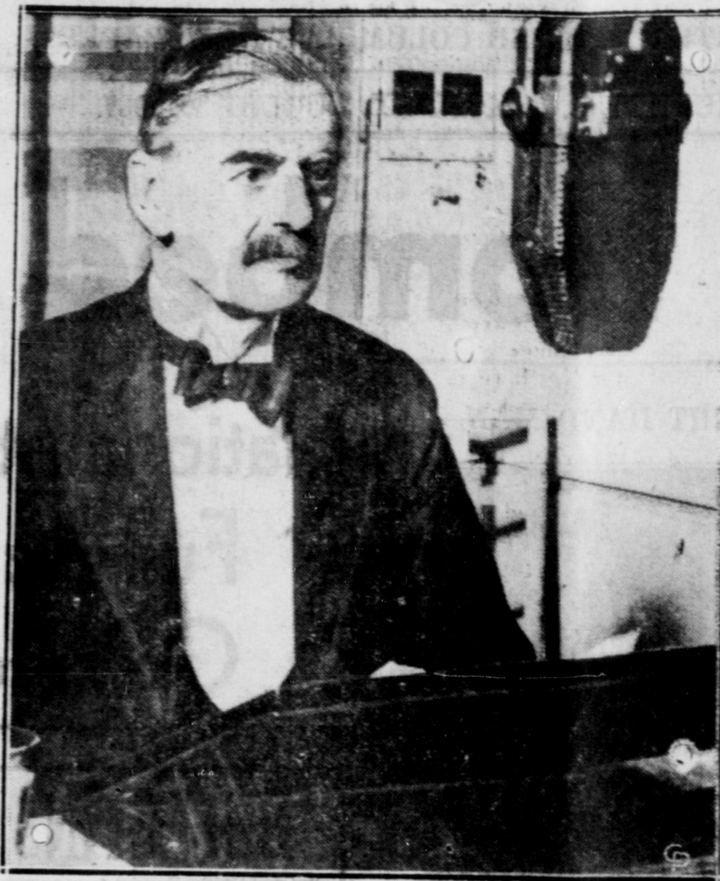
Neville Chamberlain, chancellor of the exchequer, successor to Prime Minister Stanley Baldwin, is pictured above during his most recent radio broadcast on the British budget.