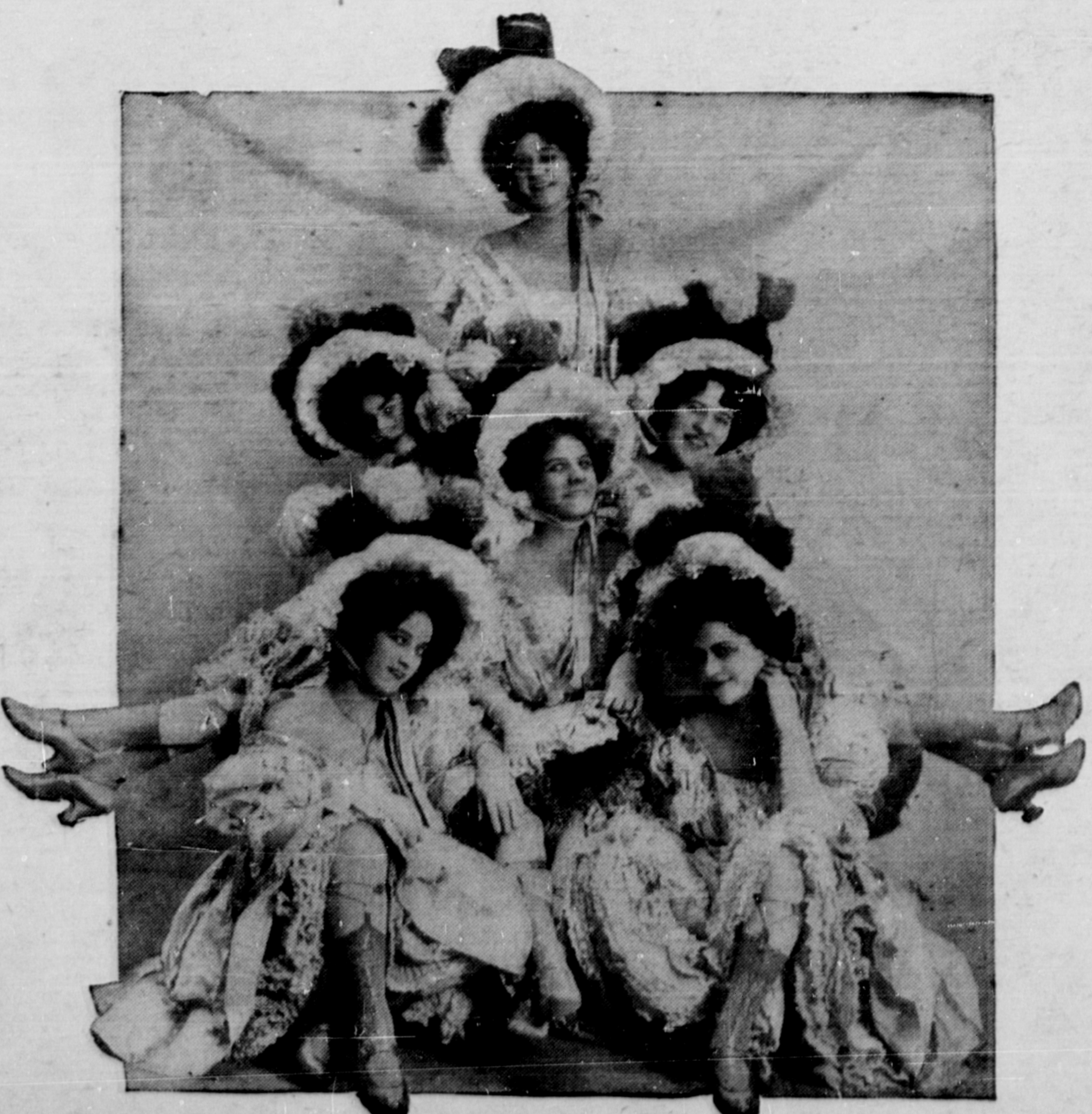
SCENE FROM "THE FOLLIES OF 1911" AT THE EMPRESS THEATRE TONIGHT

1142 Pender Street West - Vancouver, B.C. Phone 8500.