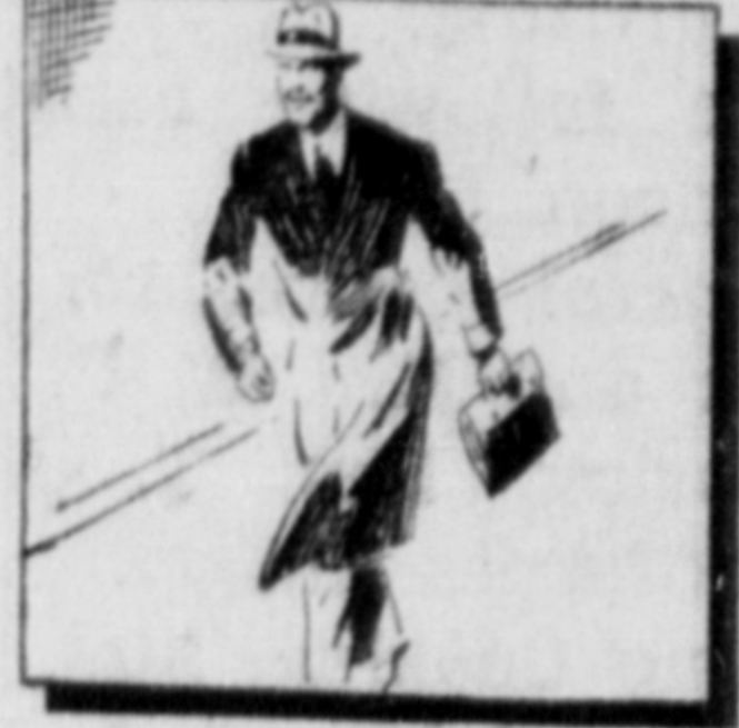
Going to Work