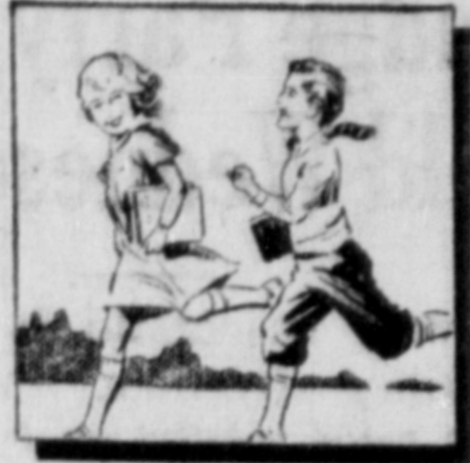
Going to School

THE CANADIAN SHREDDED WHEAT COMPANY, LIMITED Niagara Falls, Canada