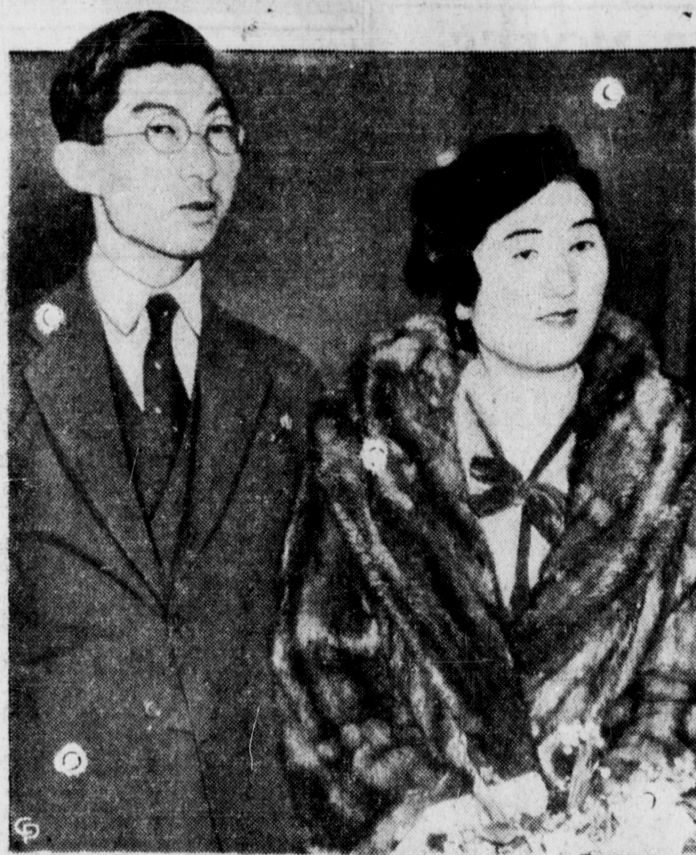
Prince Tasuhiro Chichibu and his princess are shown upon their arrival in Canada from Japan, en route to London where they will represent the royal house of Japan at the coronation of King George VI in May. The prince, brother of the emperor, sailed from New York after crossing Canada. He was widely acclaimed by Japanese residents of Canada.