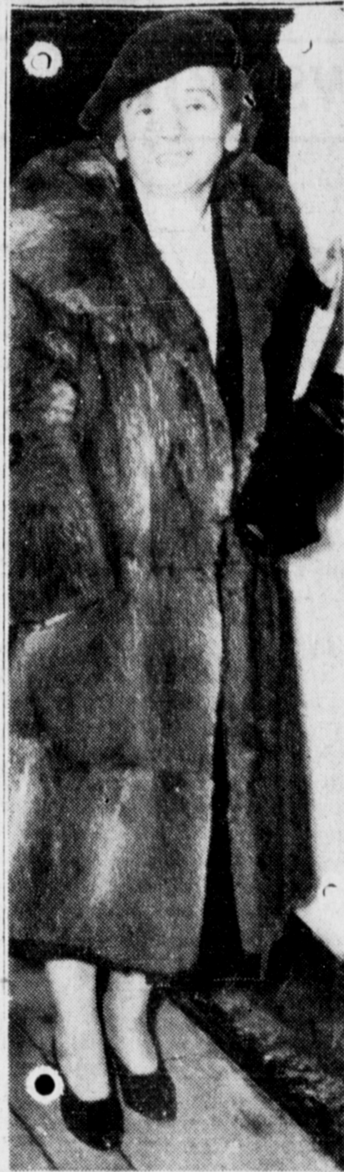
Miss Ellen Wilkinson, English Laborite member of parliament for Middlesborough, and prominent feminist, photographed as she arrived at New York for a visit to United States.