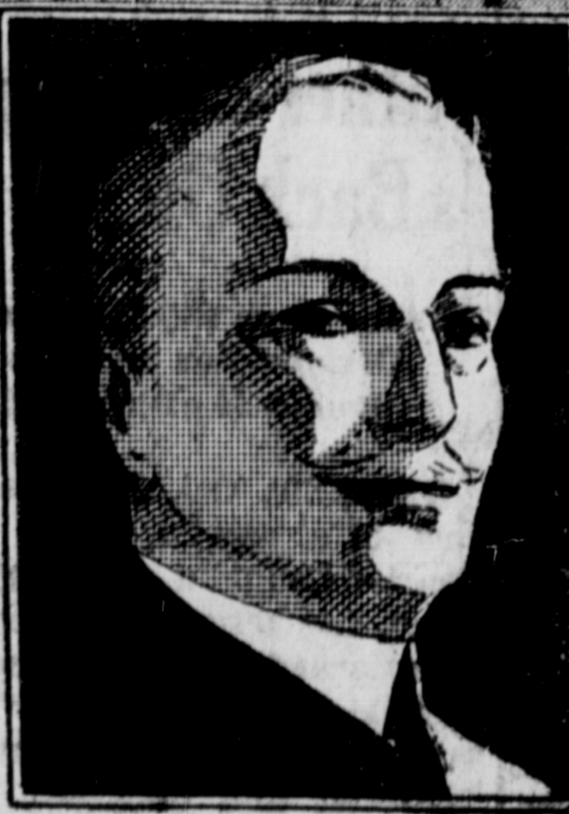
No. 14 of a Series

The Hon. E. G. Prior became Premier of British Columbia in November, 1902. He was selected to continue the government formerly headed by the Hon. James Dunsmuir, following the latter's resignation. A few months later, charges brought against the Premier in the House, in connection with the previous awarding of contracts to a firm of which it was alleged the Hon. Mr. Prior was financially interested. Regardless of whether the charges justified it or not, the Premier shortly resigned. He was succeeded by the Hon. Richard McBride. Between July, 1898, and June, 1903, the Province had five different Ministries.