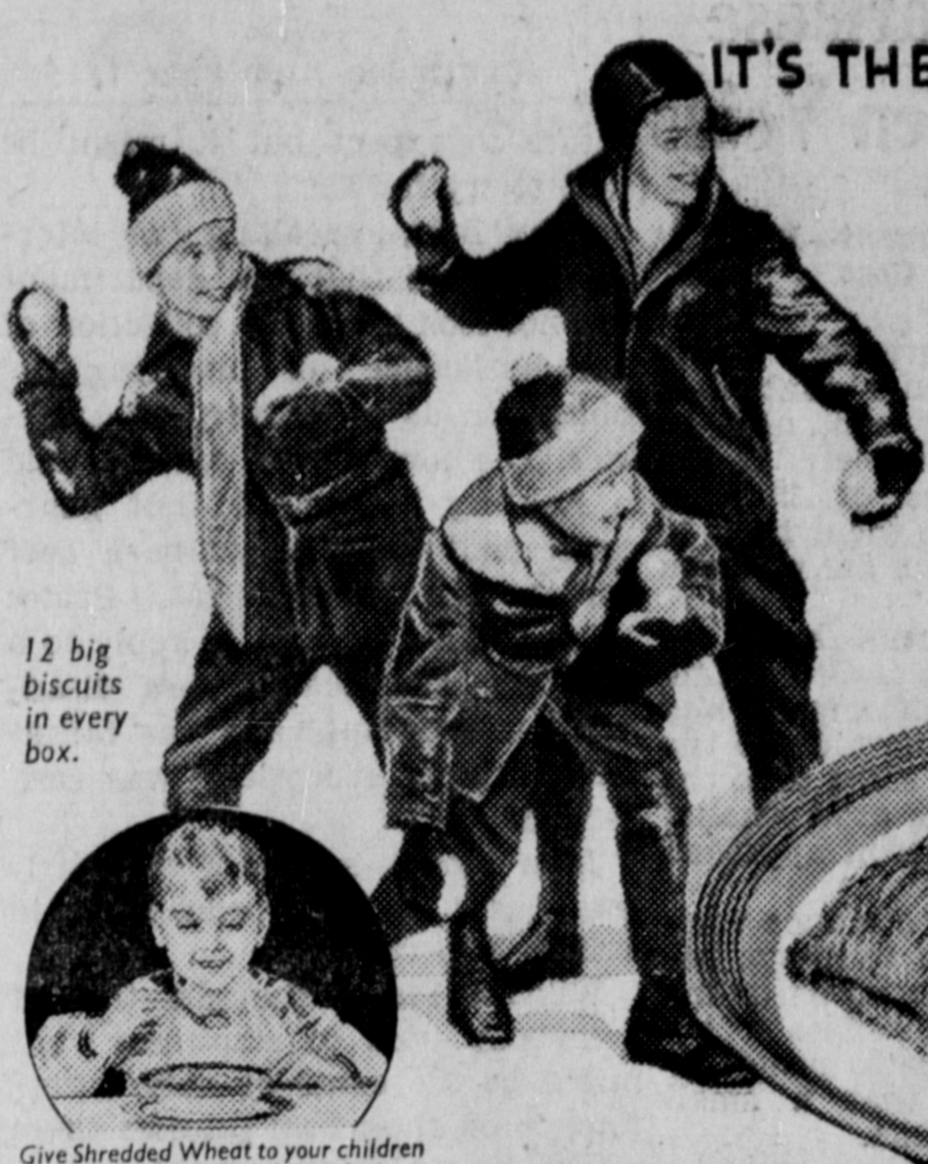
12 big biscuits in every box.