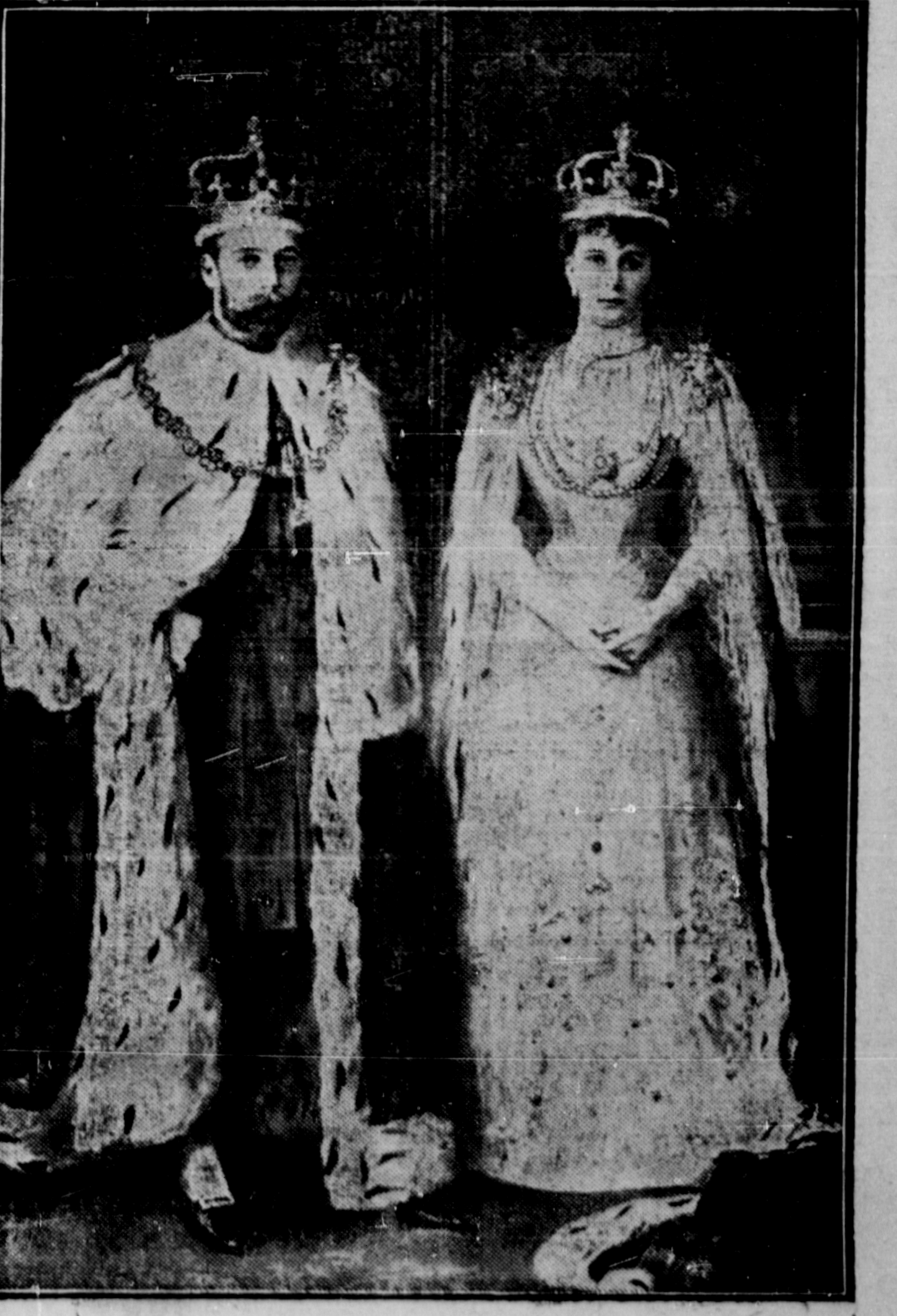
KING GEORGE AND QUEEN MARY Who have reached Bombay, India.

Society Women Who Took Part in London Raid Now Pay Penalty. London, Dec. 4.—Preferring prison to payment of fines, scores of the suffragettes who were arrested in the recent suffragette raid have gone to prison. Many of them are women known in society.