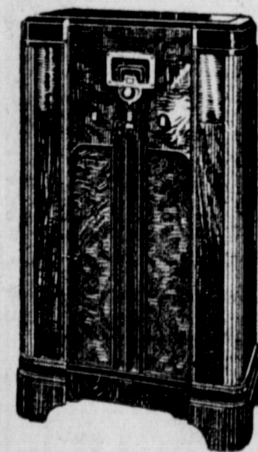
Model 5K2 $94.00

The MAGIC EYE— Tunes your radio better and finer. More sensitive than the human ear.