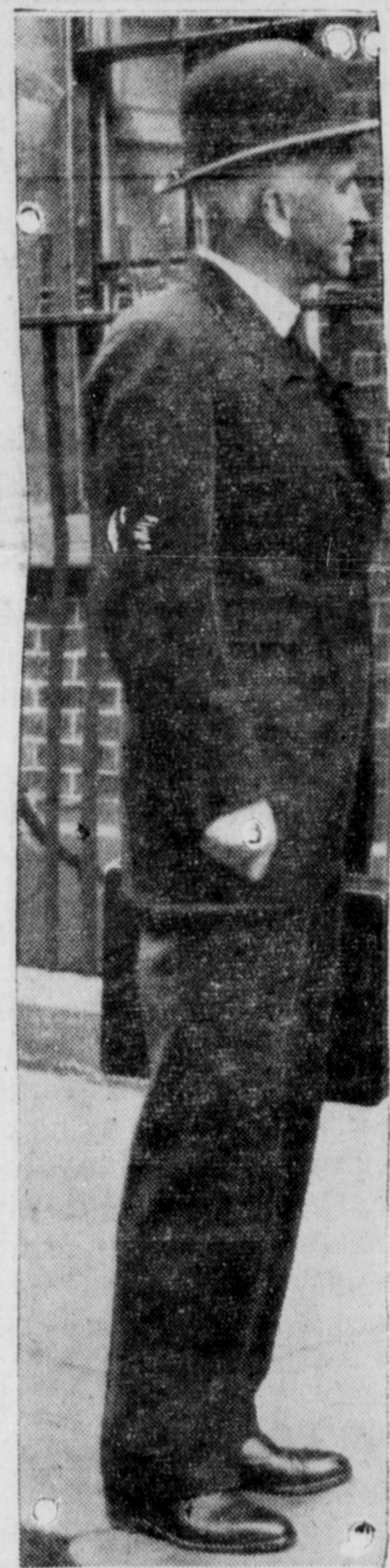
SIR JOHN SIMON

Presenting the 1938-39 fiscal budget, the Chancellor announced the government's total needs as £944,398,000, an increase of £81,500,000 over the previous year.