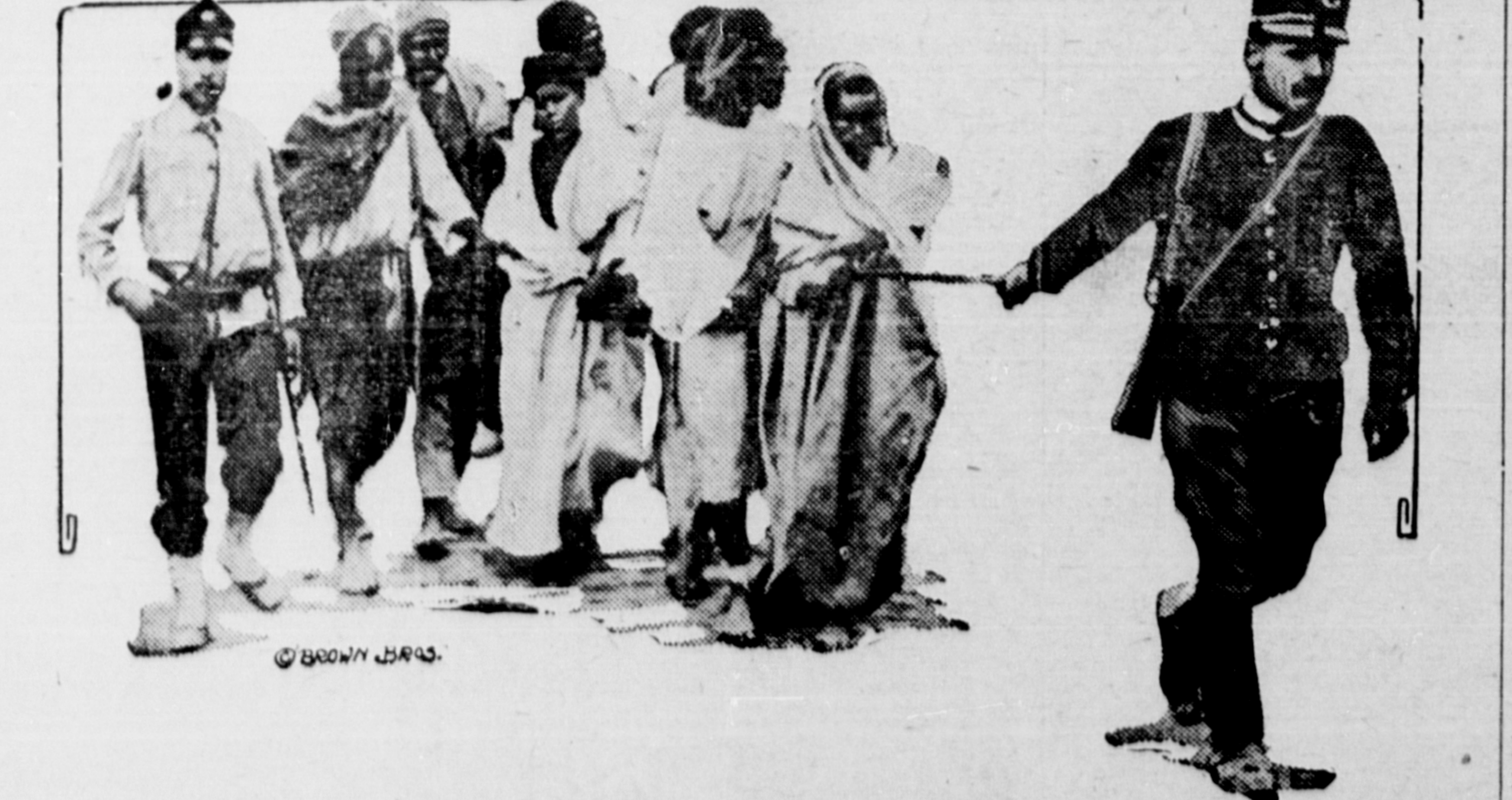
ITALIAN SOLDIERS LEADING ARAB MEN, WOMEN AND CHILDREN TO BE SHOT TO DEATH BY THE FIRING SQUAD WITHOUT EVEN A DRUMHEAD COURT-MARTIAL.