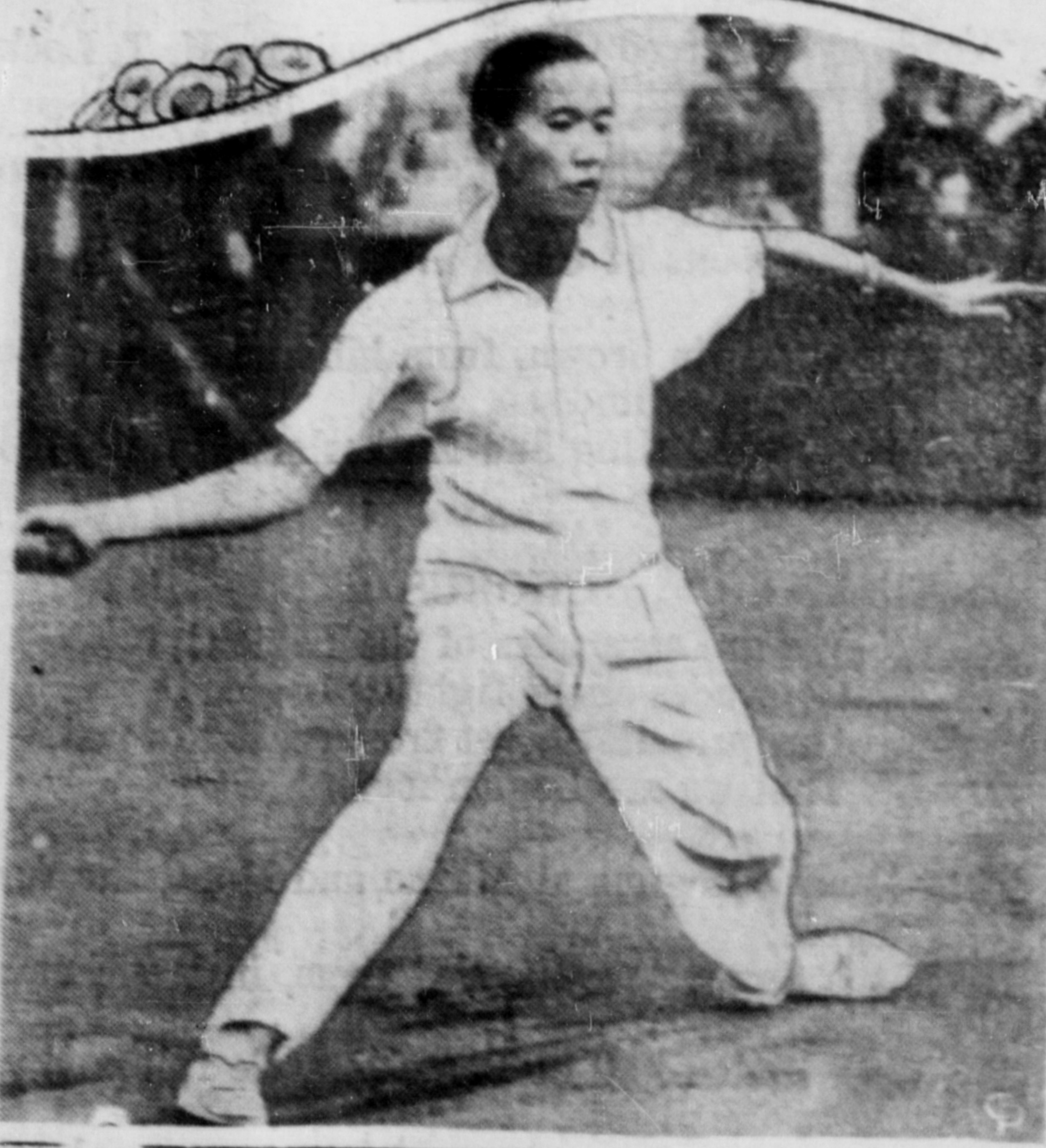
Biggest surprise of the 1938 summer tennis season was the defeat of Bunny Austin, English ace, in the finals of the British hard court championships at Bournemouth. The cause of the elevated eyebrows is shown above, the Chinese tennis star, Kho Sin Kie. He downed Austin, 6-4, 6-4, 3-6, 6-4.