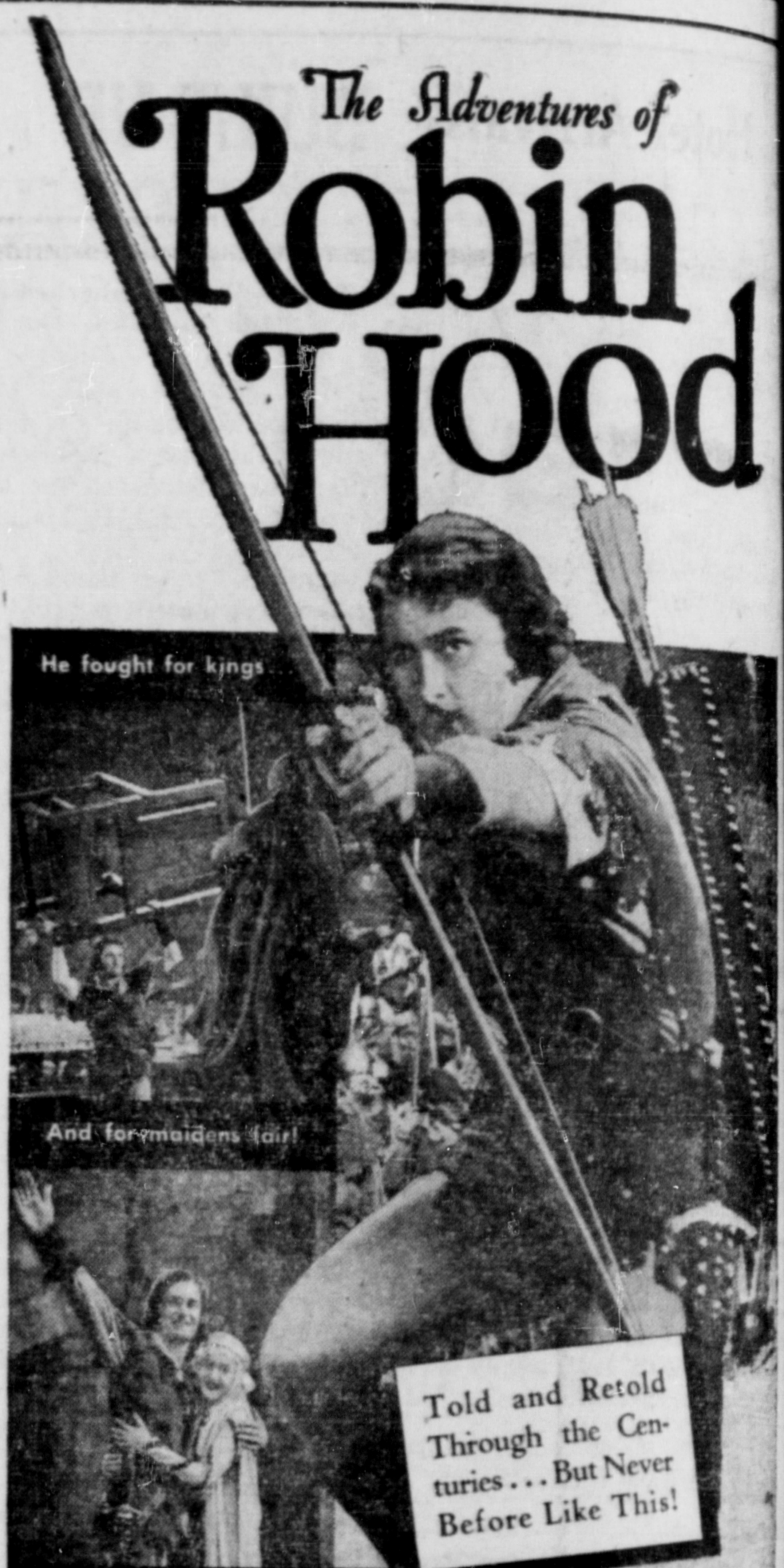
All the old thrills—a thousand new ones—in TECHNICOLOR!