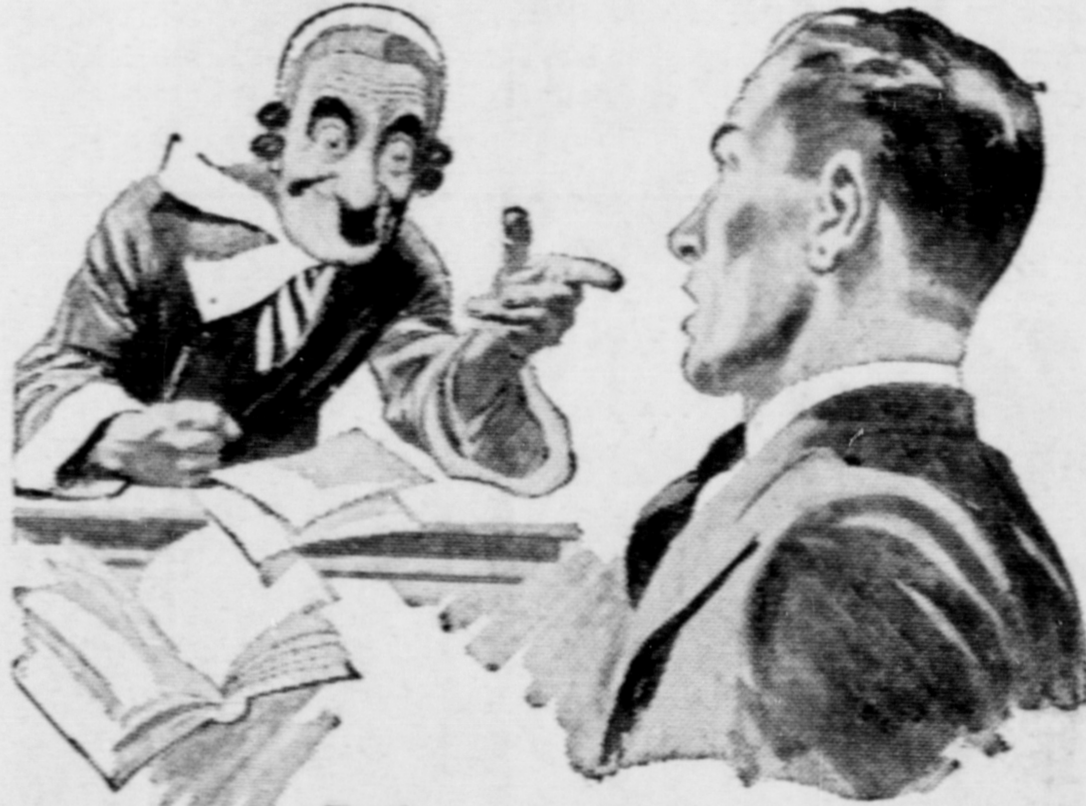
MR. JUSTICE KRUSCHEN IN THE HYGIENE COURT OF JUSTICE