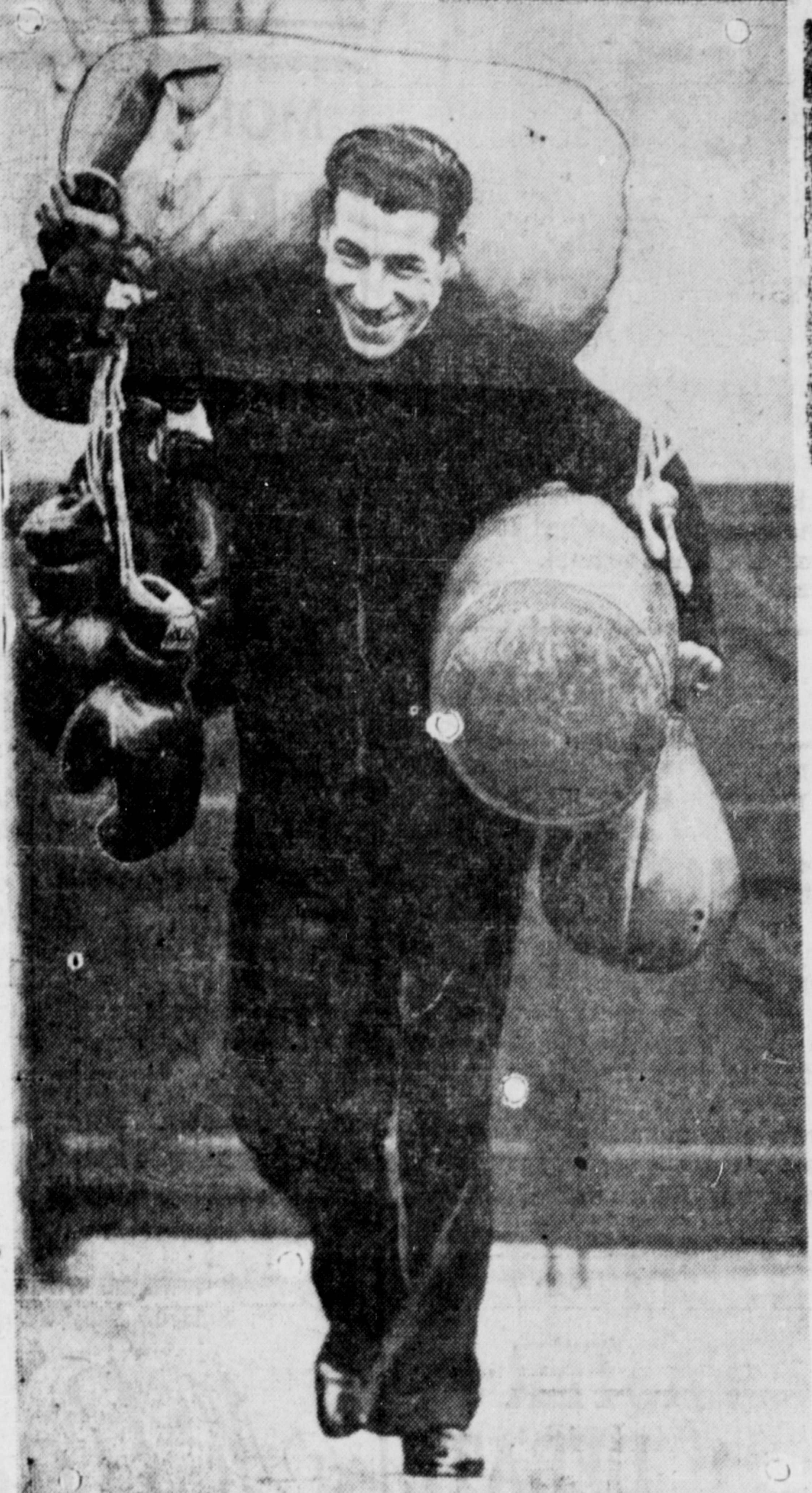
The cruiserweight championship of England is the objective of Len Harvey as he takes up quarters at Hampstead Heath to prepare for his match with Jock McAvoy. Bright and early one morning he was caught trotting up the incline with all the gadgets necessary for his occupation.