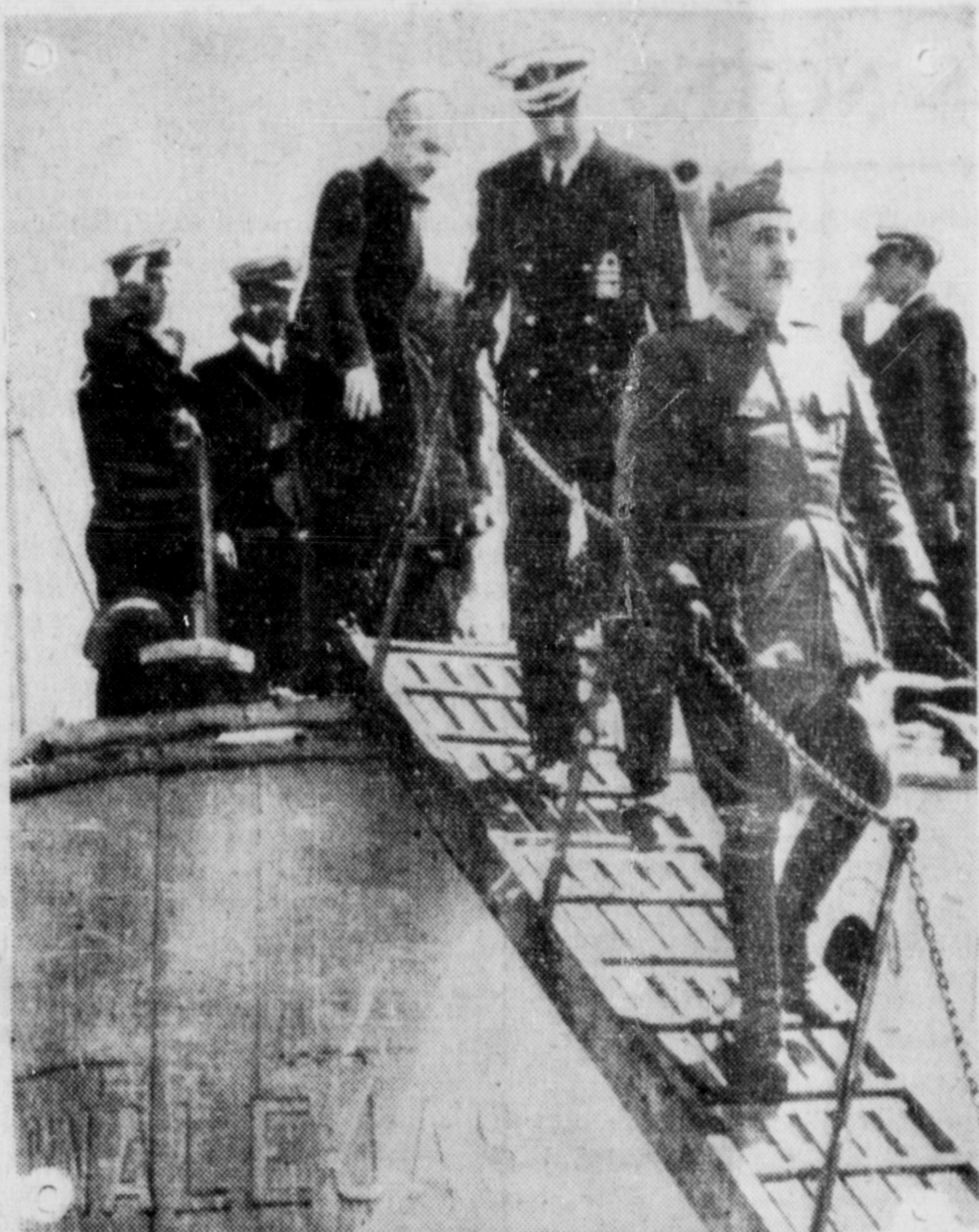
General Francisco Franco, insurgent leader of Spain, shown descending the ladder leading from the bridge of the battleship Canalejas, after having reviewed his sea forces recently. While his battleships have rendered good accounts of themselves in patrolling Spanish waters, his airplanes have wreaked havoc not only on government positions but on foreign vessels.