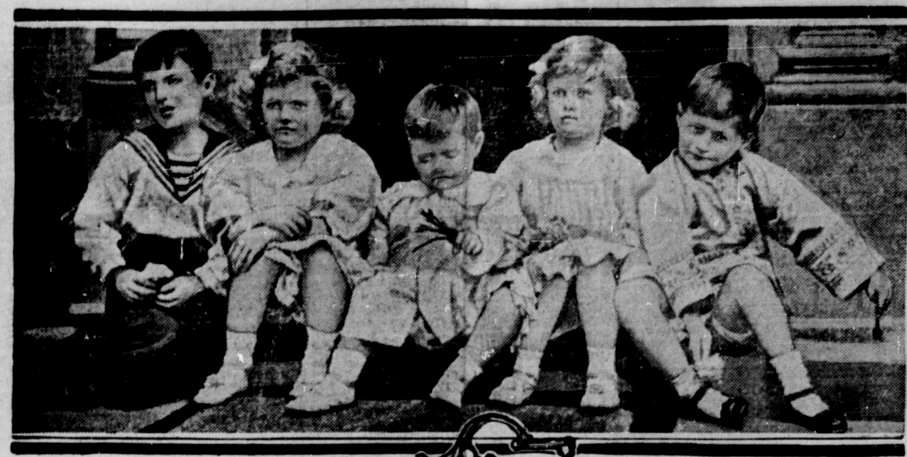
FIVE FUTURE KINGS AND QUEENS OF EUROPE

This morning Cape Lazo reported the S.S. Prince George passing north bound at 5.50 a.m. She will arrive on Sunday morning. Pachena spoke the S.S. Tees at 3 a.m. eastbound, and reports the S.S. Prince Rupert at 12.15 a.m. in Fitzhugh Sound southbound.