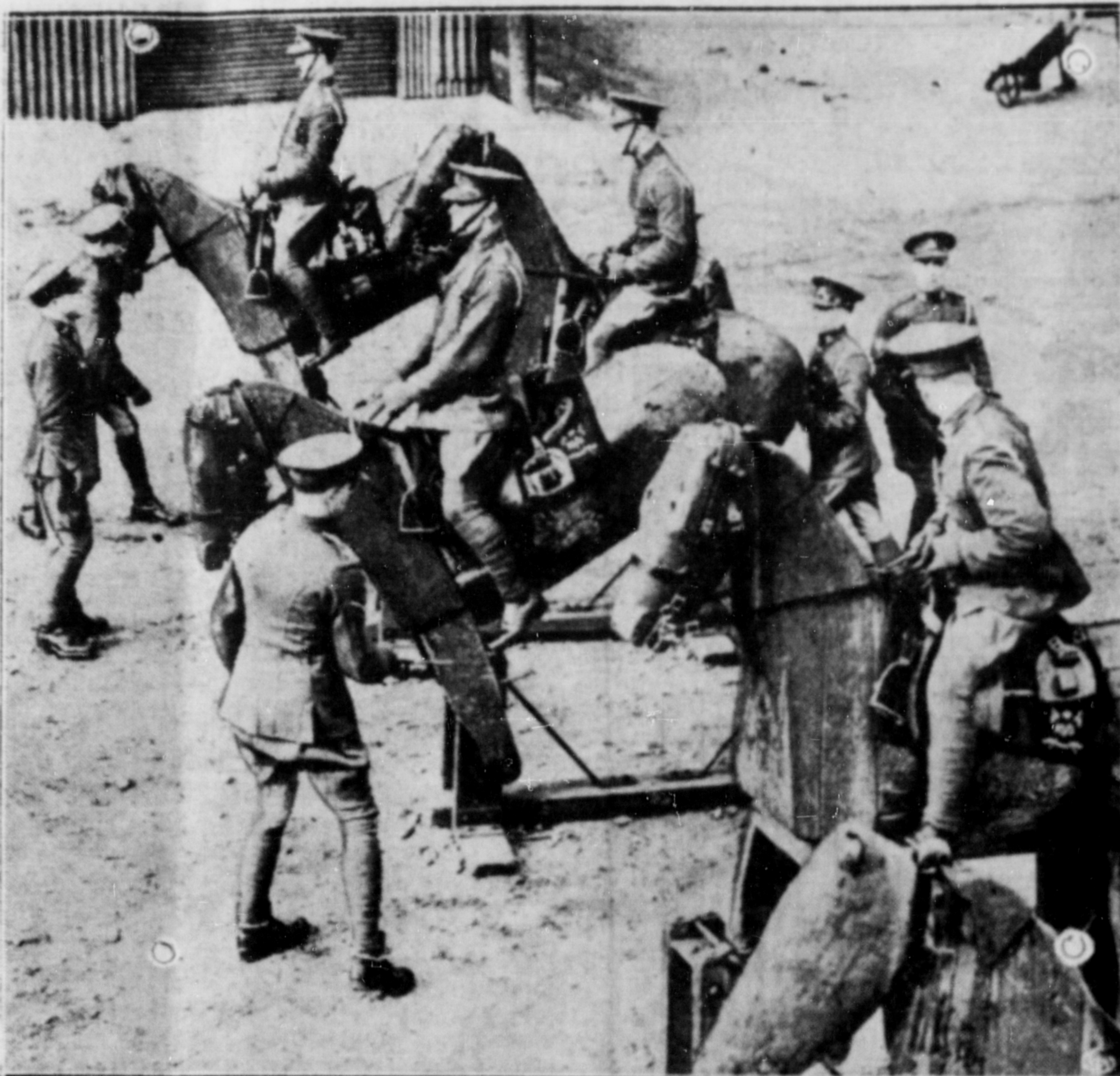
Before the novice is entrusted with a valuable cavalry charger in the British army, he must prove his efficiency in horsemanship aboard a wooden rocking horse. Here you see a class of recruits for the 16th Lancers undergoing the necessary—if undignified—early training at Hounslow. The galloping motion of a horse is duplicated by other soldiers pushing the horses from behind.