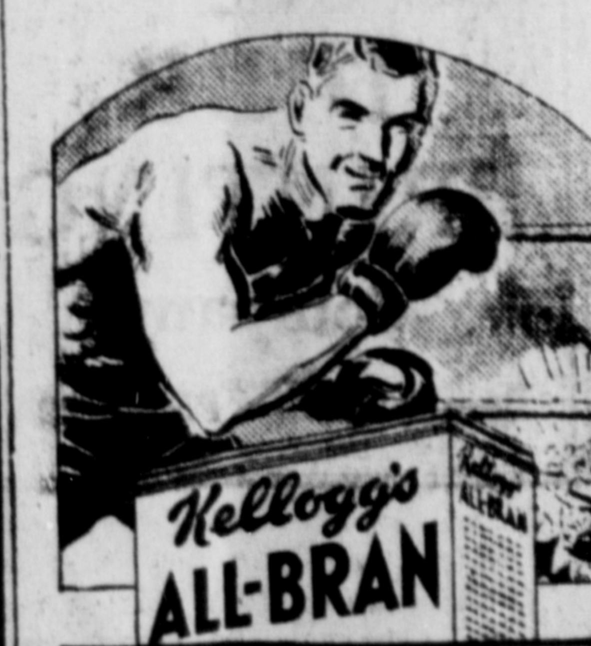
Made by Kellogg in London, Canada. At your grocer.

ATTENTION Brother Moose! You are invited with partners, Tuesday, May 9 at 9:30 p.m. Social Women of Moose. (108)