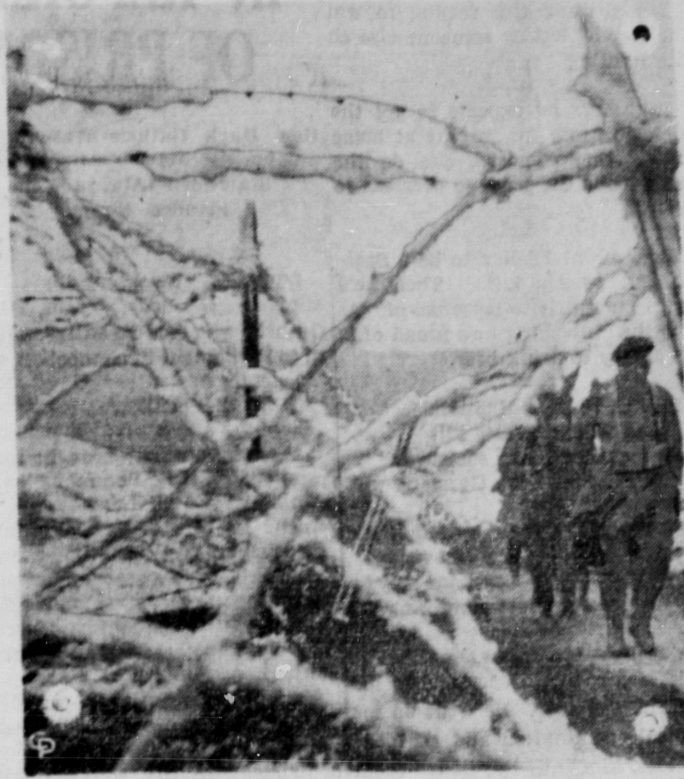
Winter comes early in higher mountain reaches and already French troops, "somewhere in the French Alps" are going through their manoeuvres under difficulties added to the normal hardships of the Alps by King Winter. Some of them are seen here as they passed by ice-encrusted barbed-wire entanglements.