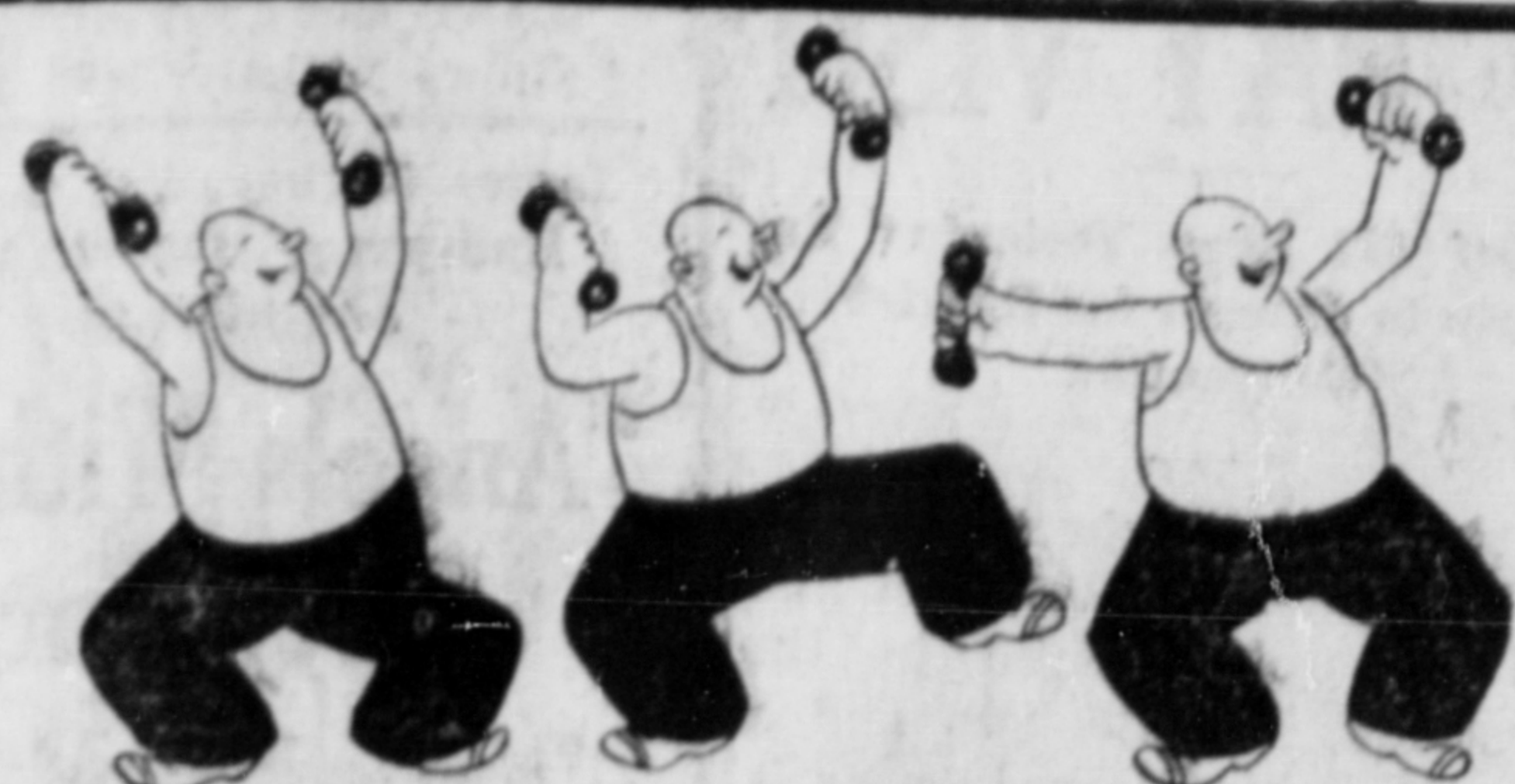
The Morning After Taking Carter's Little Liver Pills