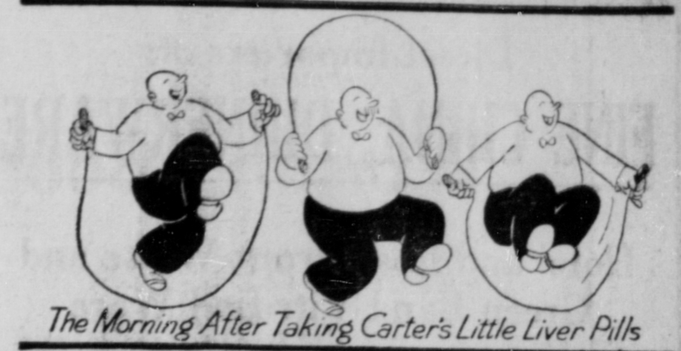
The Morning After Taking Carter's Little Liver Pills