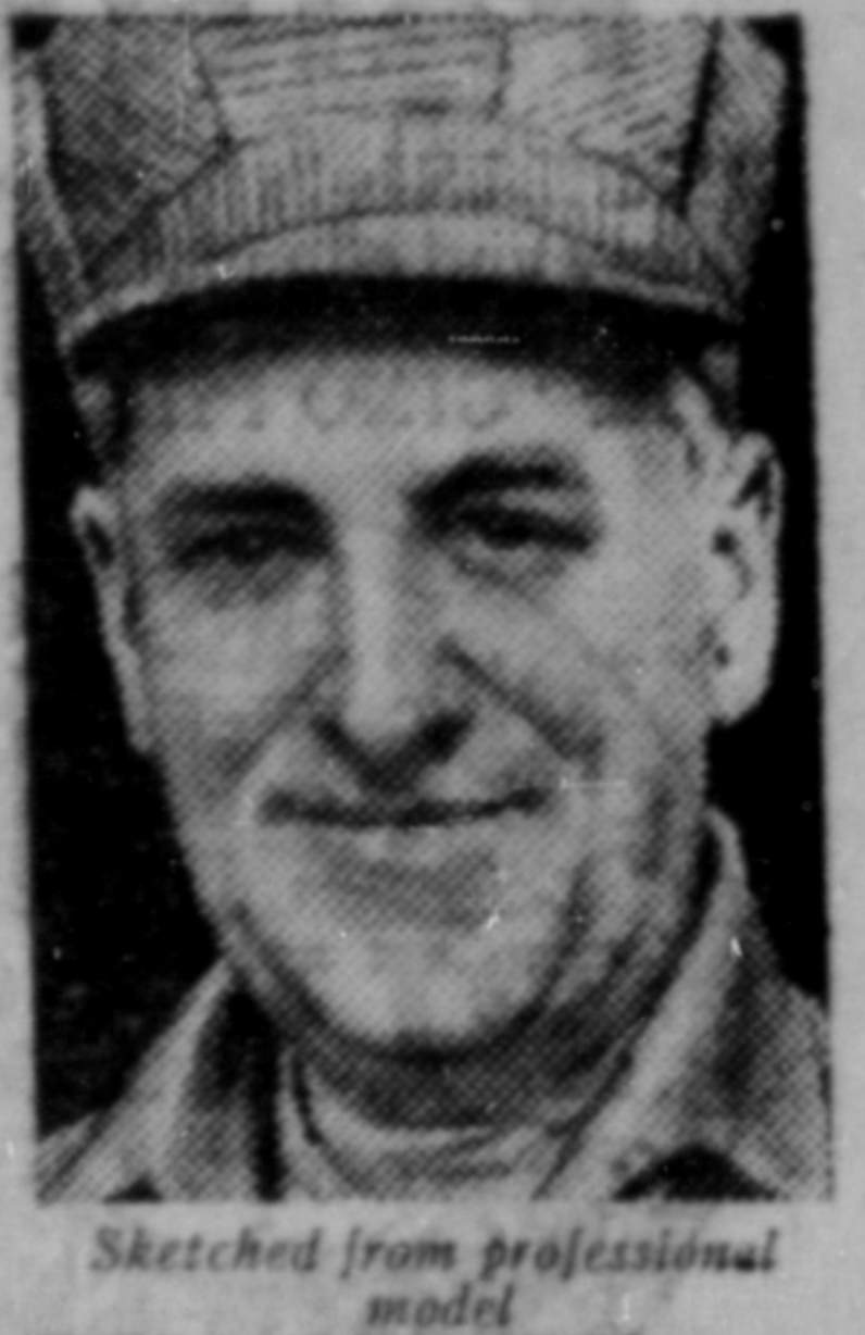
Sketches from professional model IMPROVED FORMULA—ALKALINE—SWEETENS THE STOMACH