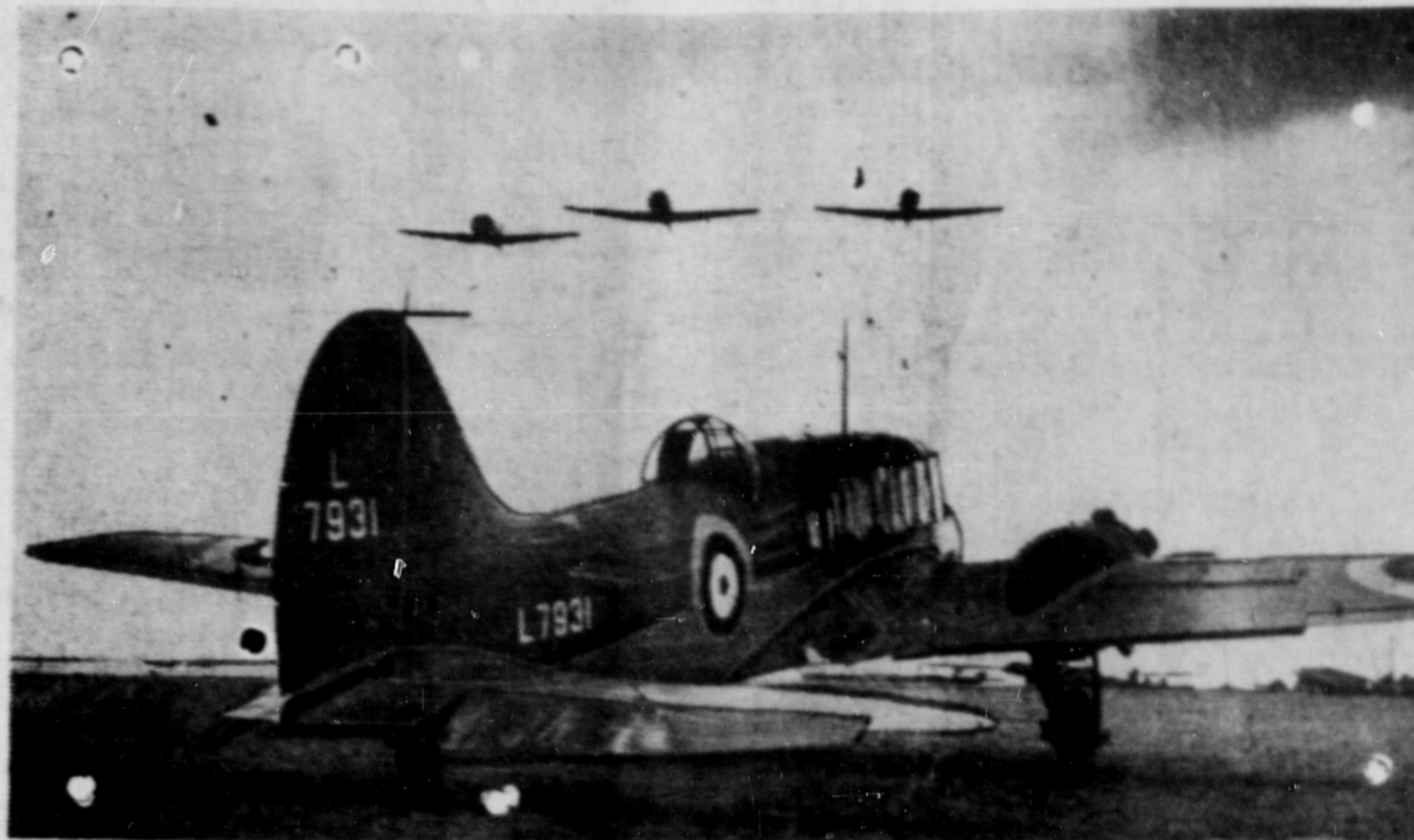
A flight of the very latest fighters, on dawn patrol, skim over an air-drome "somewhere in England" as pilots who are in the last stages of their training handle the controls.