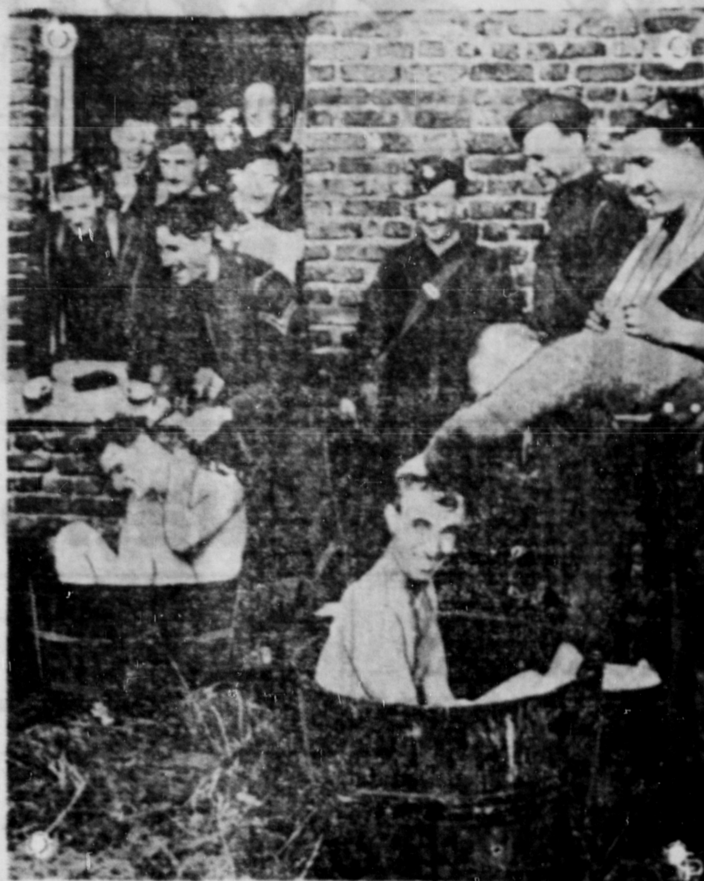
war, but time out must be taken to keep clean, so these British troops enjoy their Saturday bath. No de luxe accommodations for "Tommy Atkins" today, however, only tin pails and the old wooden tubs were available, so they make the best of it. This photo was passed by the British censor.