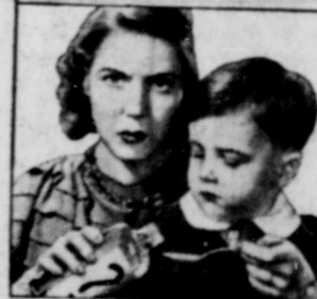
A child's life is beyond the price of pennies

A "Bargain" Remedy You Don't Know All About