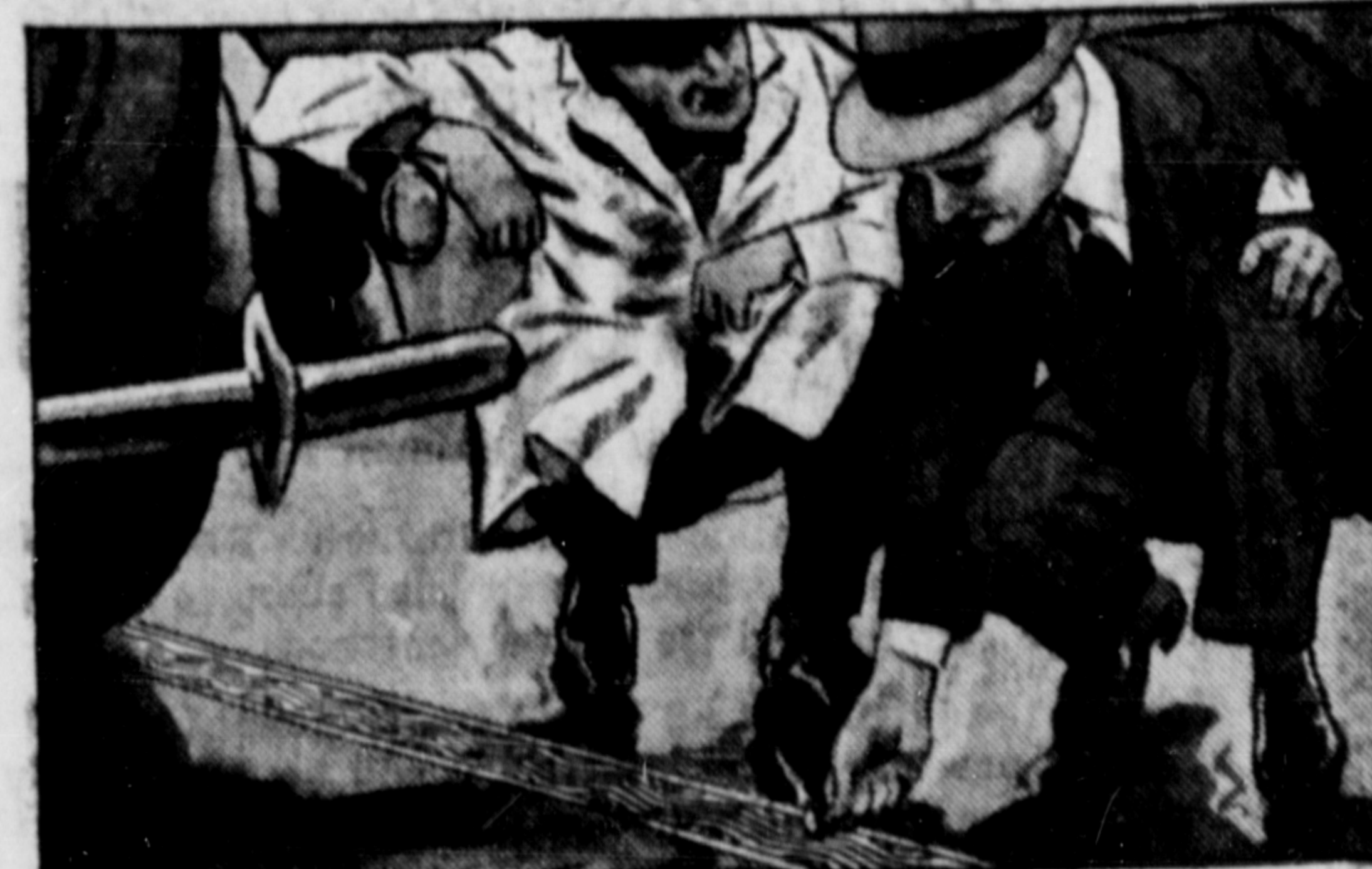
The tire even looks different. Your Goodrich dealer will tell you the Life-Saver Tread sweeps wet roads so dry you can light a match on its tracks! Yes, when a tire sweeps wet roads so dry you can actually light a match on its track that's plenty of proof it can be depended upon in emergencies to give you a quick non-skid stop!

WHEN A CHILD darts across your path in a blinding rain—when a train suddenly looms ahead at a crossing—in a hundred and one situations you may meet on a rainy day—think what it will mean to have tires on your car that really dry the road. Yes, when quick non-skid stops are a MUST, here is the tire that will give you the quickest ones you've ever had! And here's the proof: