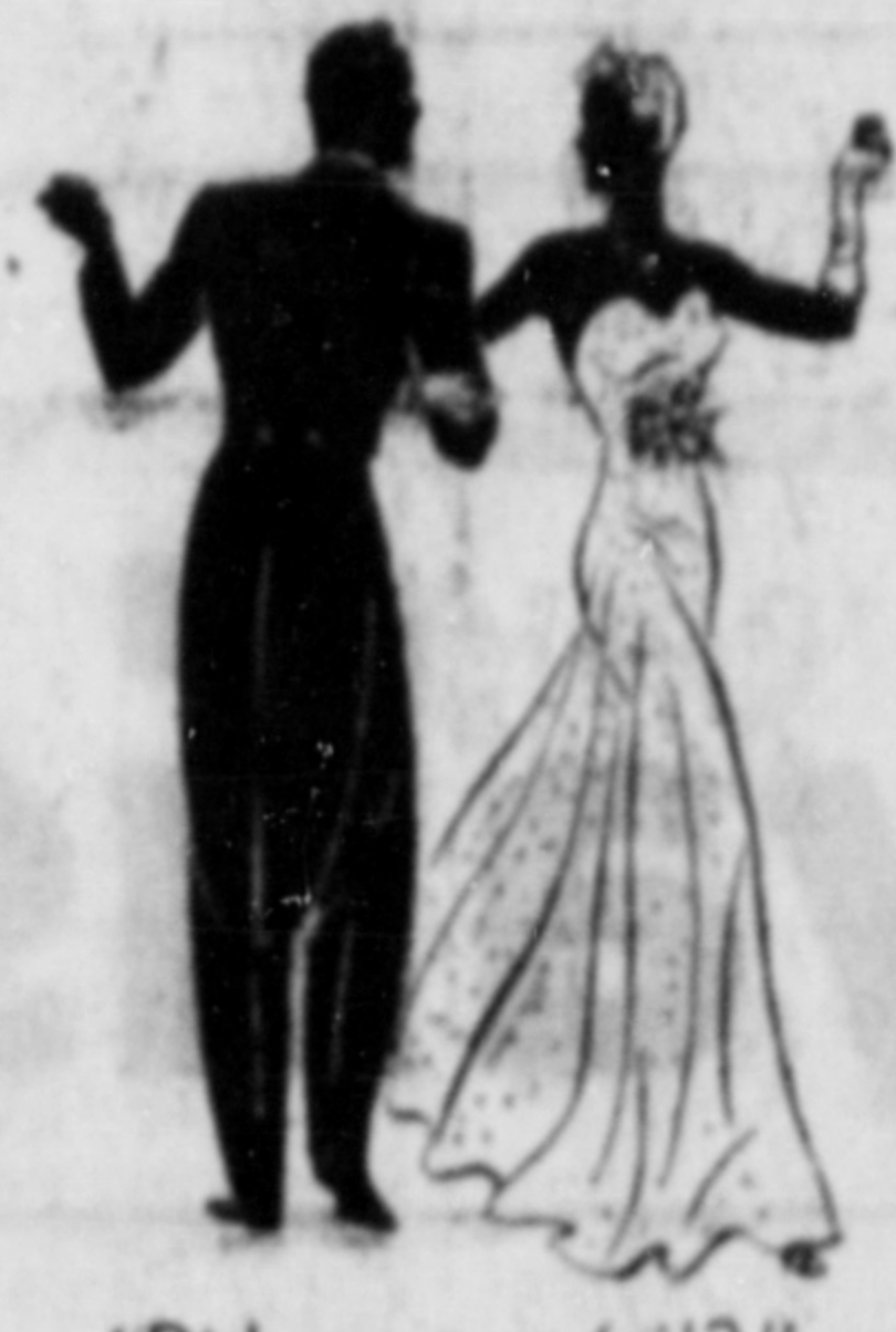
"Did you say 'oi'?" "Yes—oi' want a Sweet Cap!"

for last season by Middlesex County Cricket Club. The amount included $7,573 the county's share of the Australian tour profits.