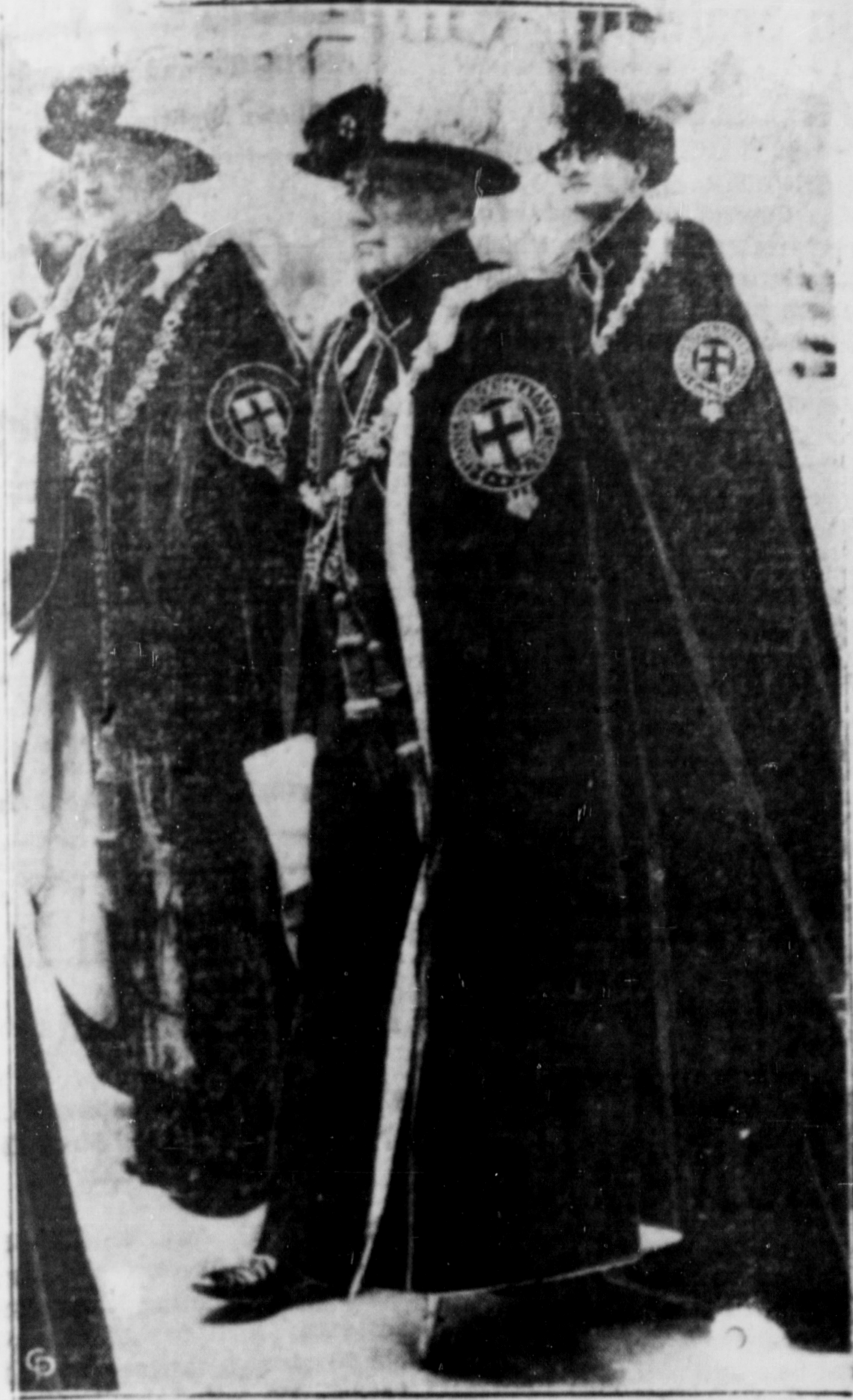
Attired in his robes of Knighthood of the Garter, Earl Baldwin of Bewdley, former Prime Minister of England, is shown in the procession that marked a service at Windsor, Eng., for Knights of the Garter. The ancient ceremony, first held in 23 years, was attended by King George and Queen Elizabeth. Earl Baldwin is followed by the Earl of Clarendon.