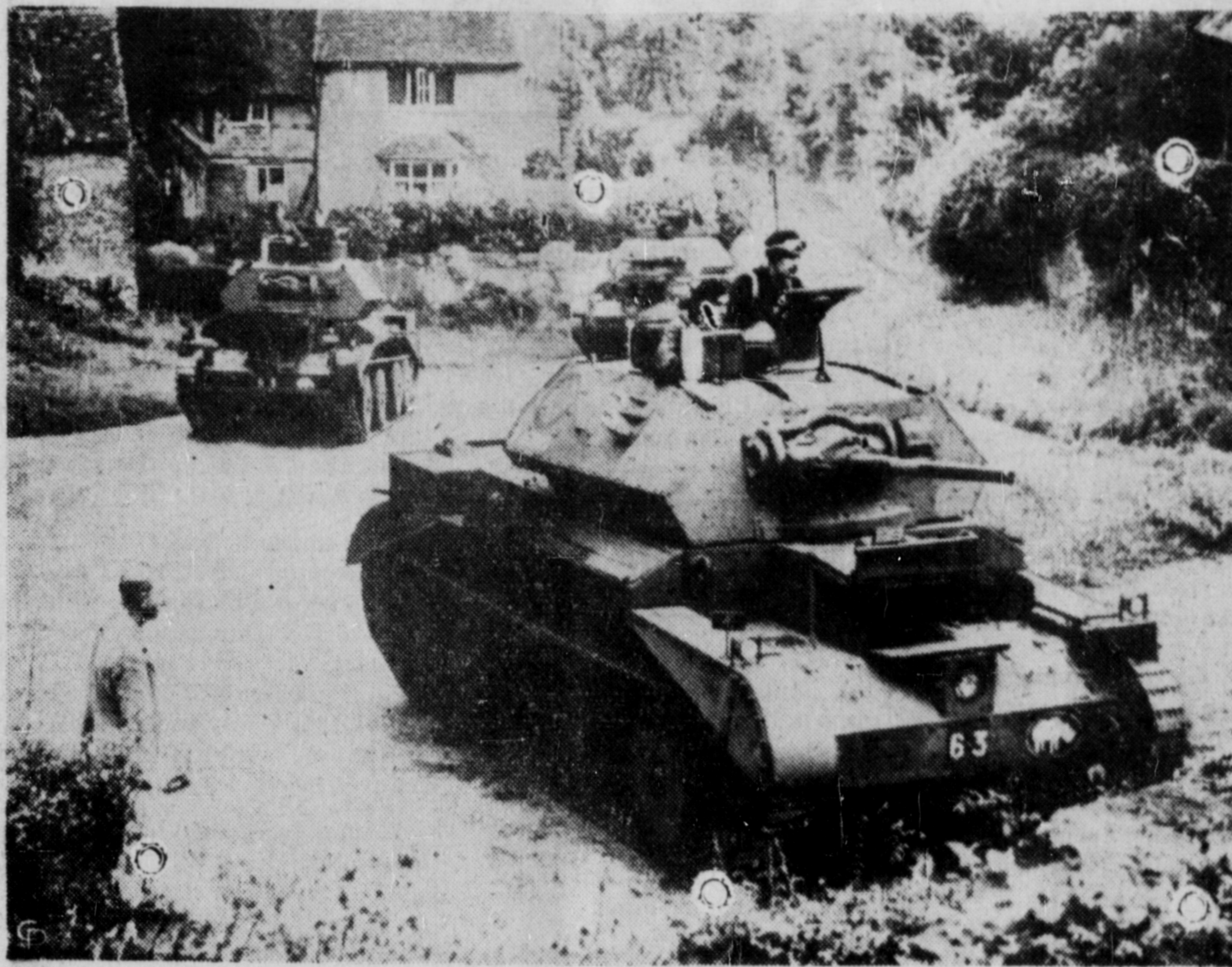
Heavy tanks of the Royal Tank Regiment rumble over a common somewhere in Southern England during manoeuvres. These tanks are just one of the many obstacles that Hitler's Nazi forces will have to contend with if they do decide to launch an invasion of England.