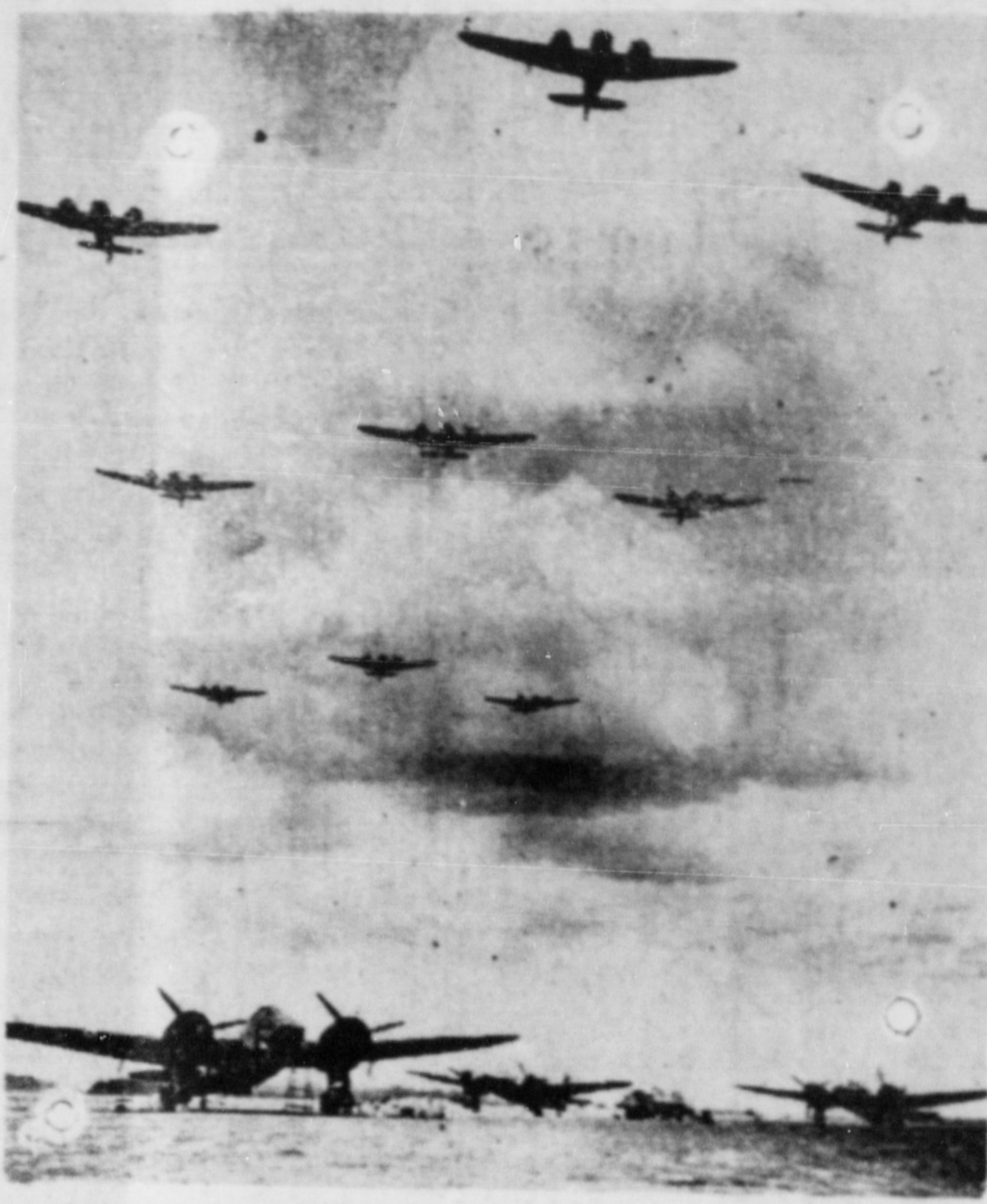
A flight of Bristol Blenheim bombing planes is shown taking off from a Royal Air Force base in France on an early morning flight over Germany. The bombers are heavily armed fore and aft with heavy machine guns.