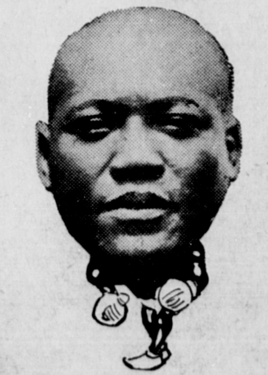
Heavyweight Boxing Champion