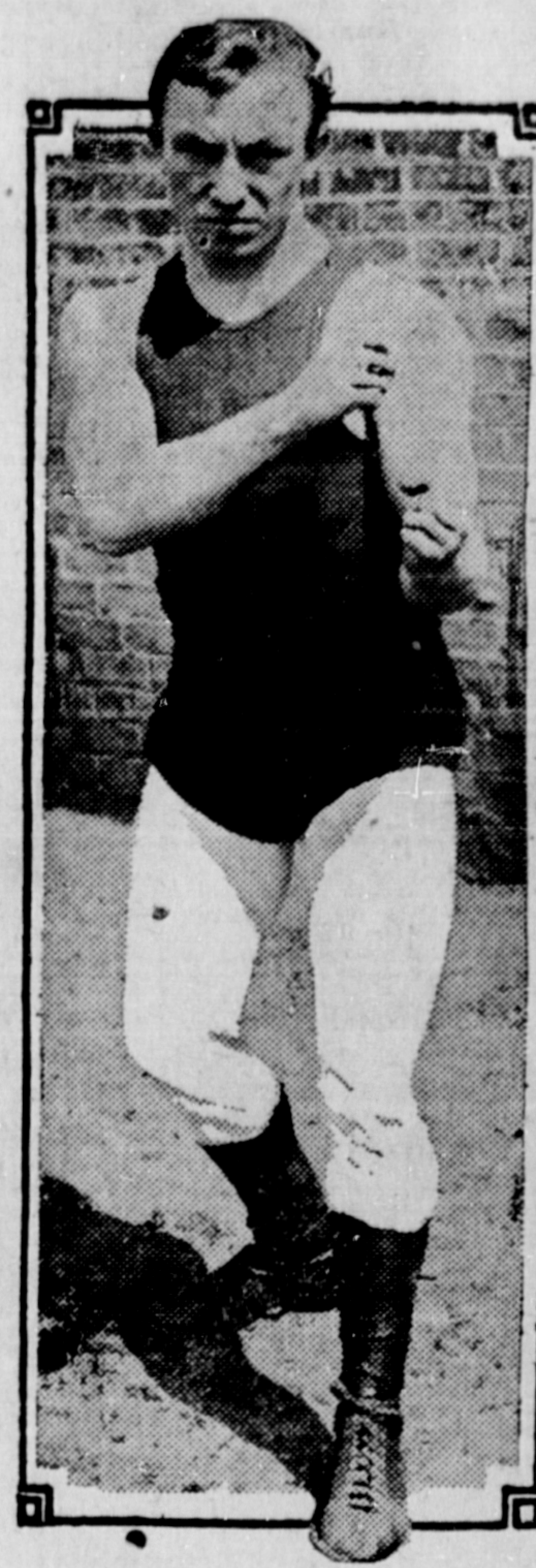
Bantam Boxing Champion