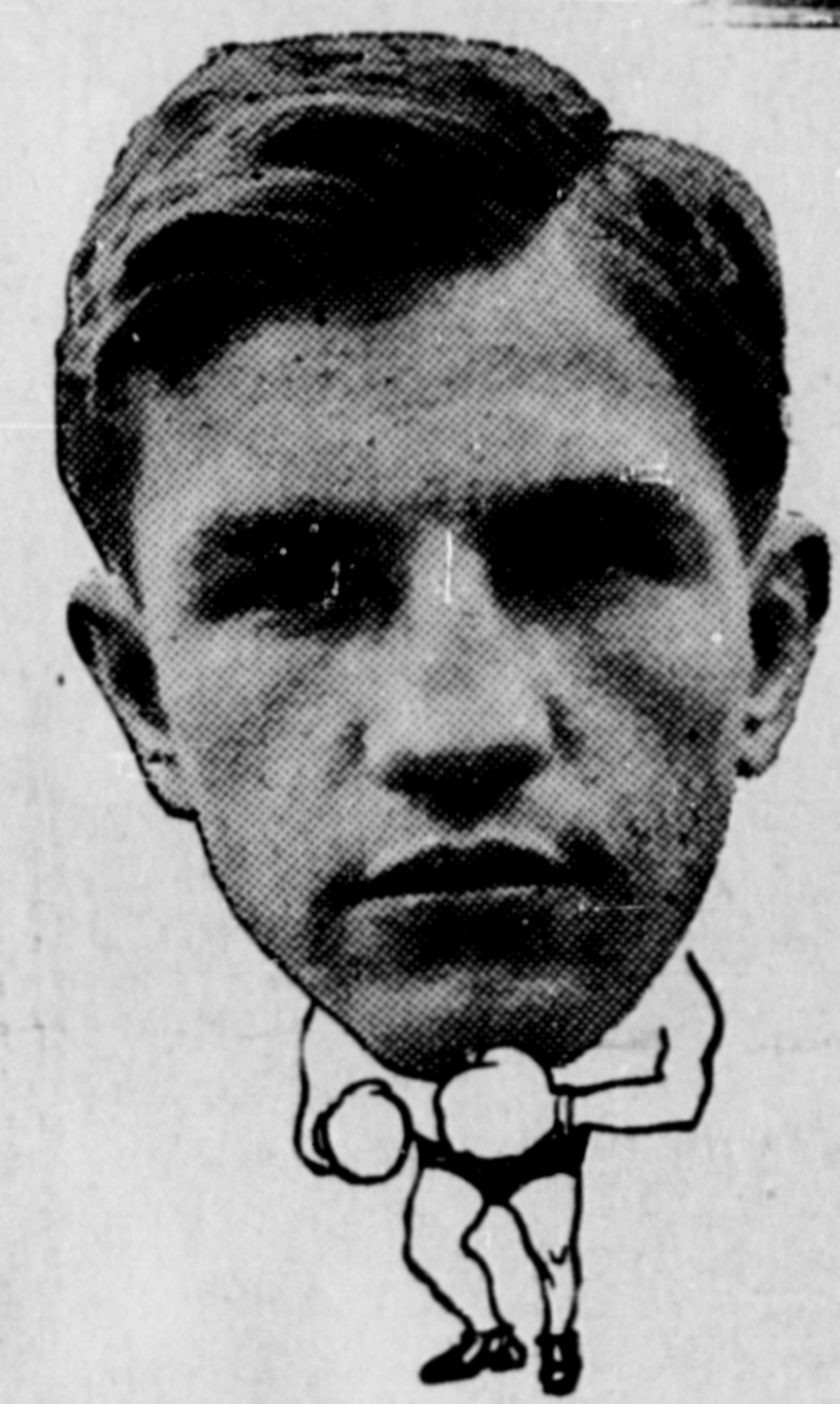
Lightweight Boxing Champion